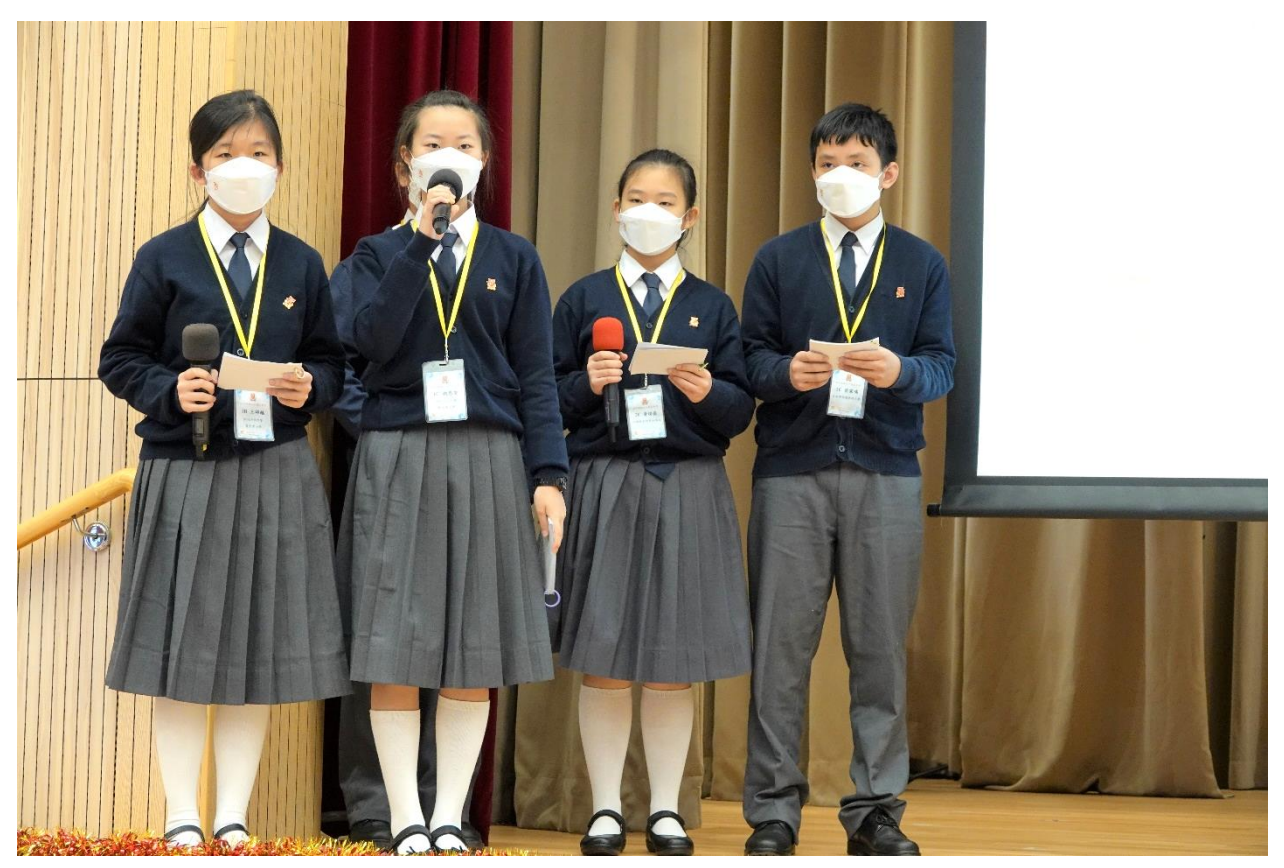
Students share useful interview tips with the audience