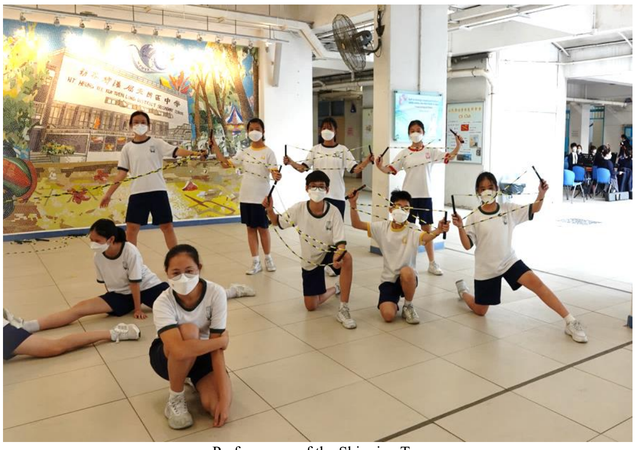
Performance of the Skipping Team