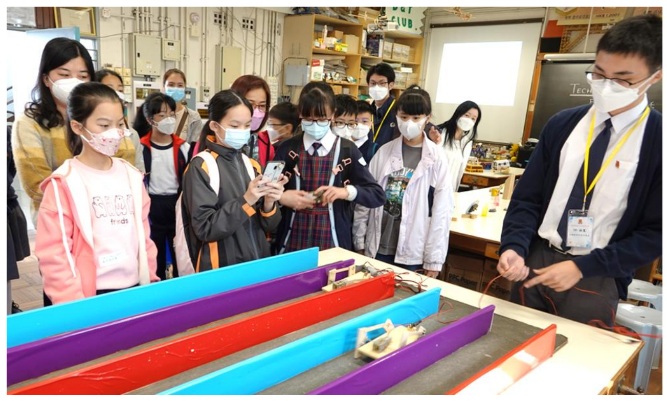
Science & Technology project: Four-legged robot race