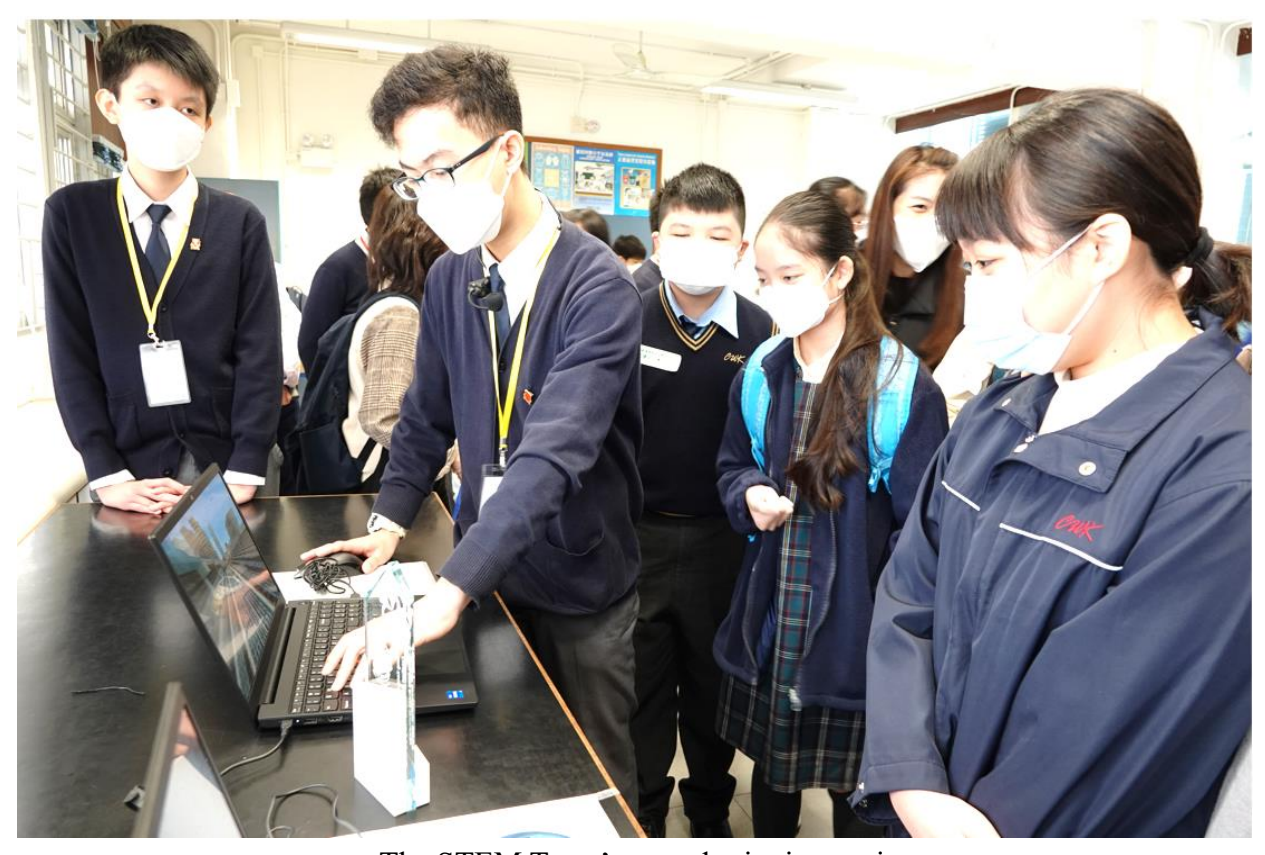
The STEM Team's award-winning project