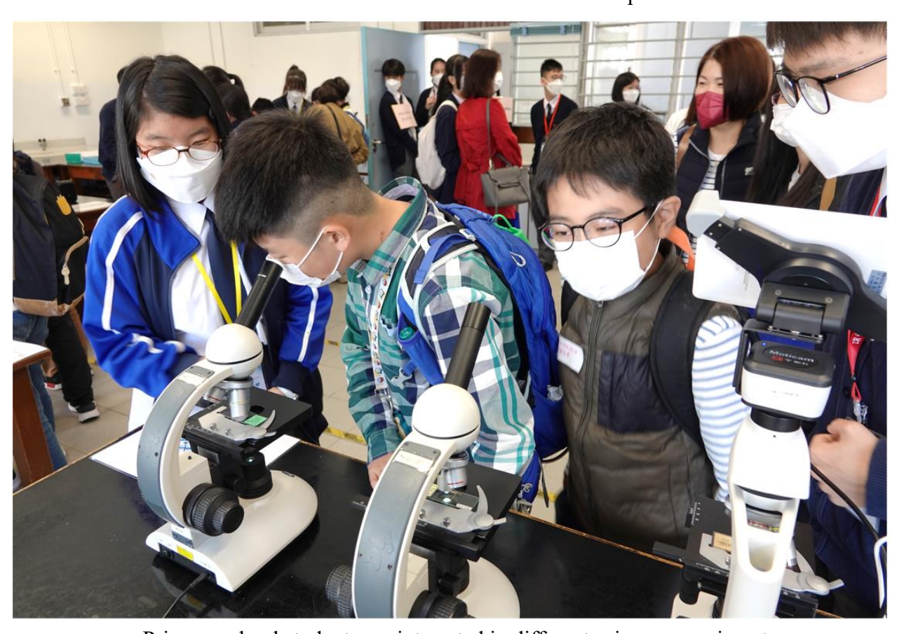
Primary school students are interested in different science experiments