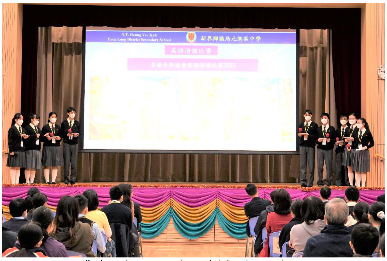
Students give a presentation on their learning experience