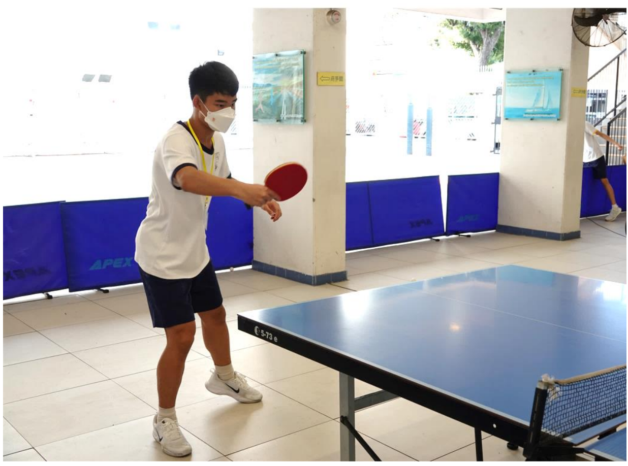
Table Tennis Team member shows brilliant skills