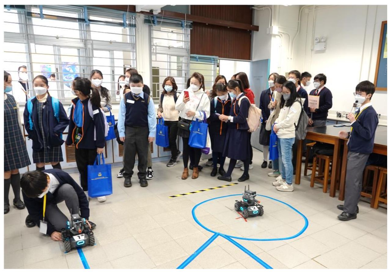
Robotics demonstration by the STEM Team