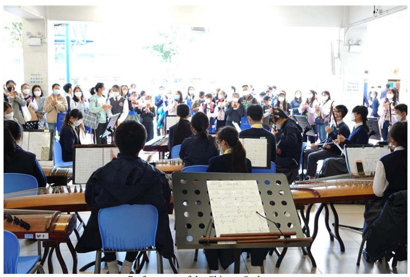
Performance of the Chinese Orchestra