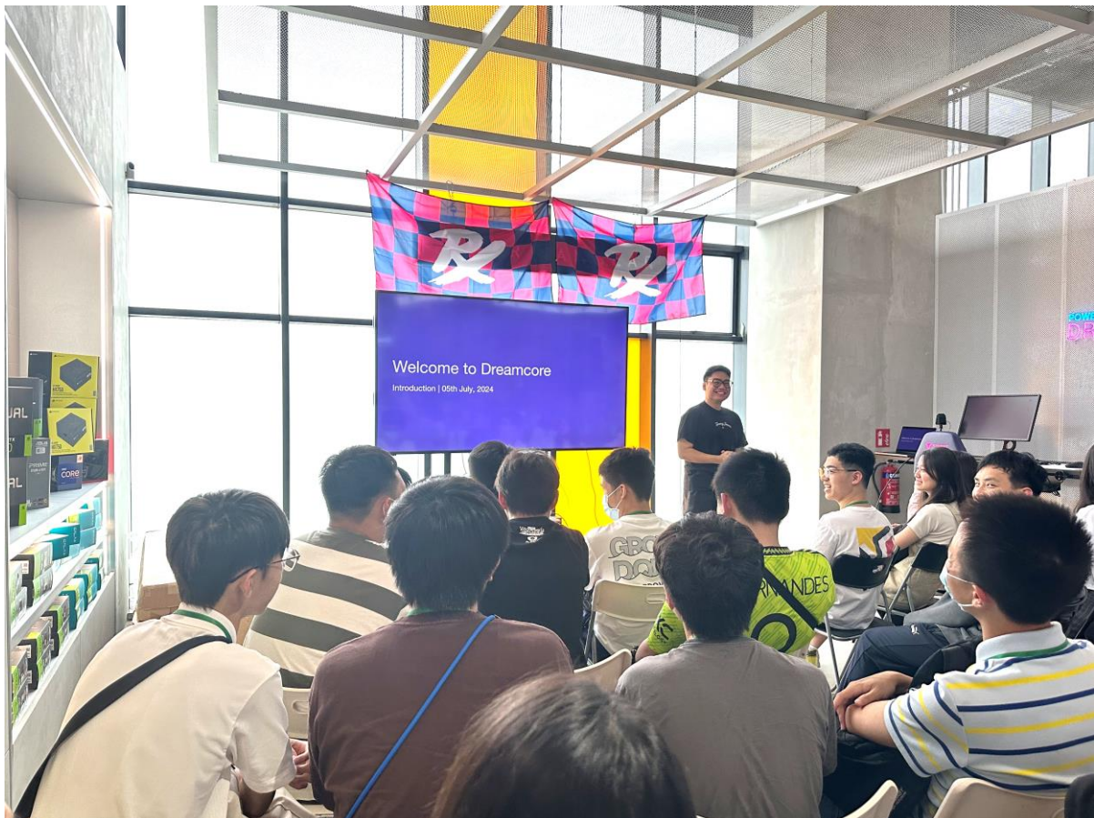
Students visit a Singapore IT company – Dreamcore.