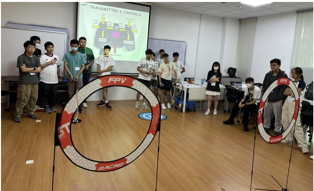
Students attempt to maneuver the drones through the keyhole gates