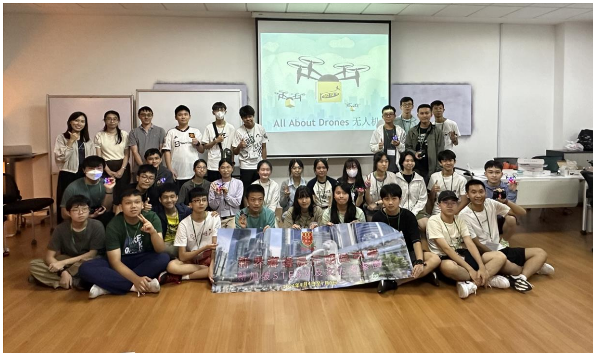
Group photo taken after attending the drone lesson