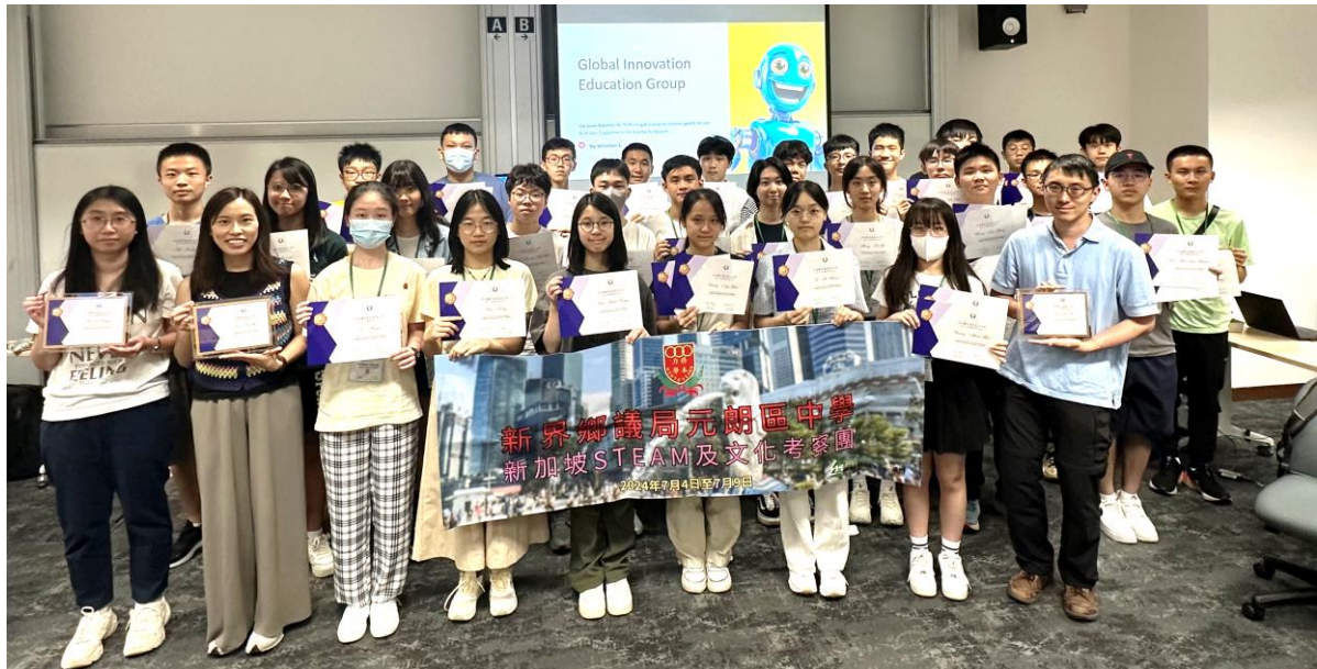
Students are awarded their certificates after completing their lessons at the Singapore Management University