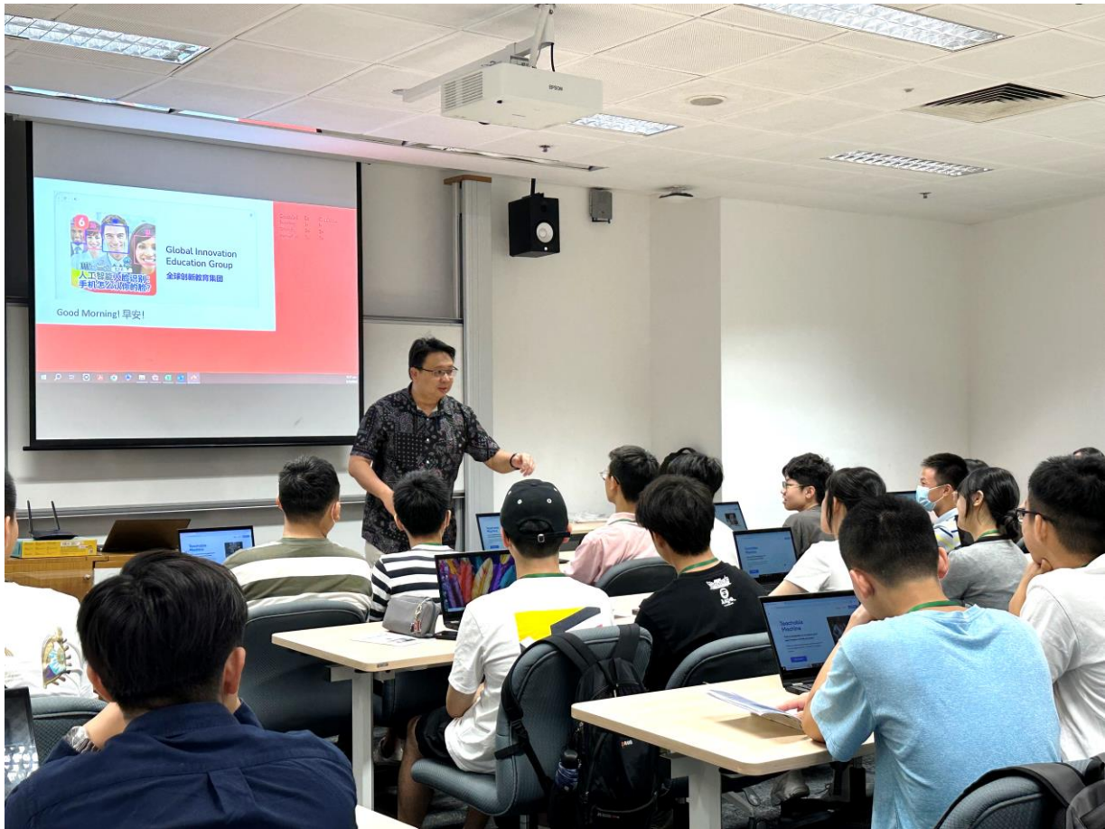
Students focus intently on learning how to utilize computer applications for training AI.