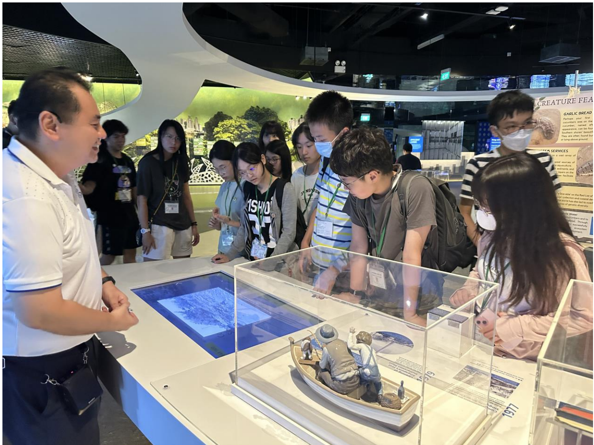
Students are intrigued by the exhibits at the Sustainable Singapore Gallery