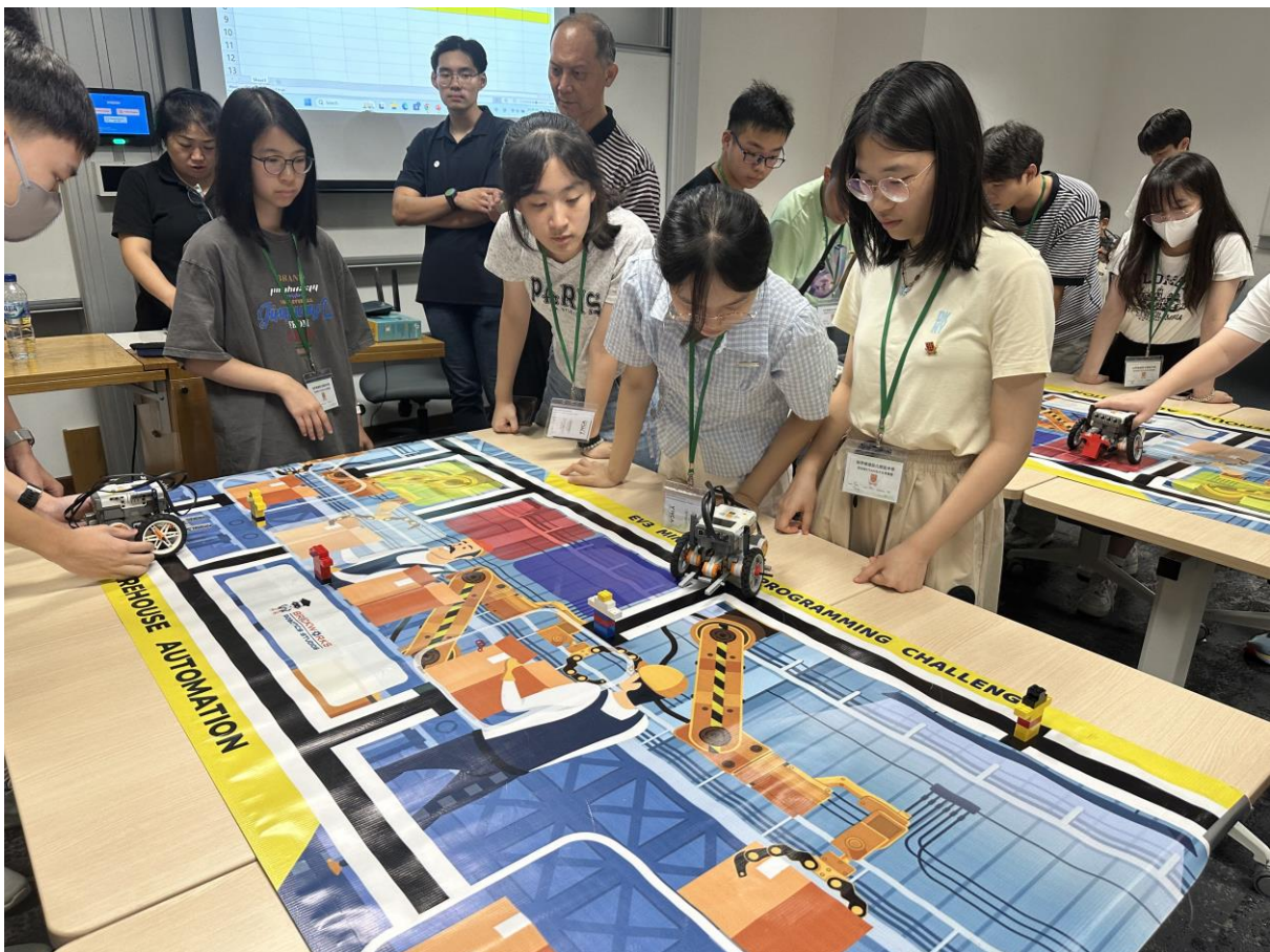
Students evaluate their robots to determine if they can successfully complete the assigned tasks