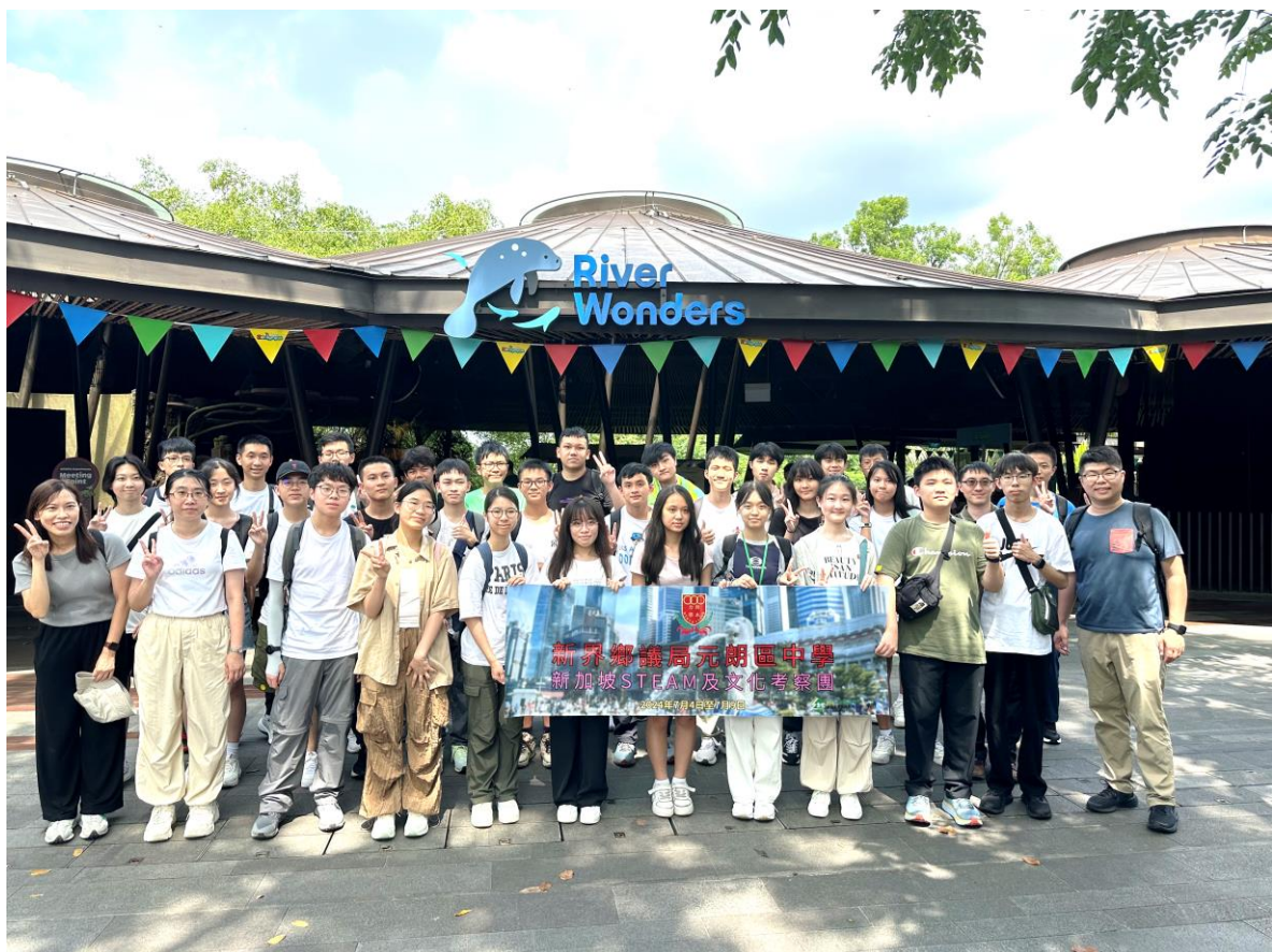
Students visit the River Wonders