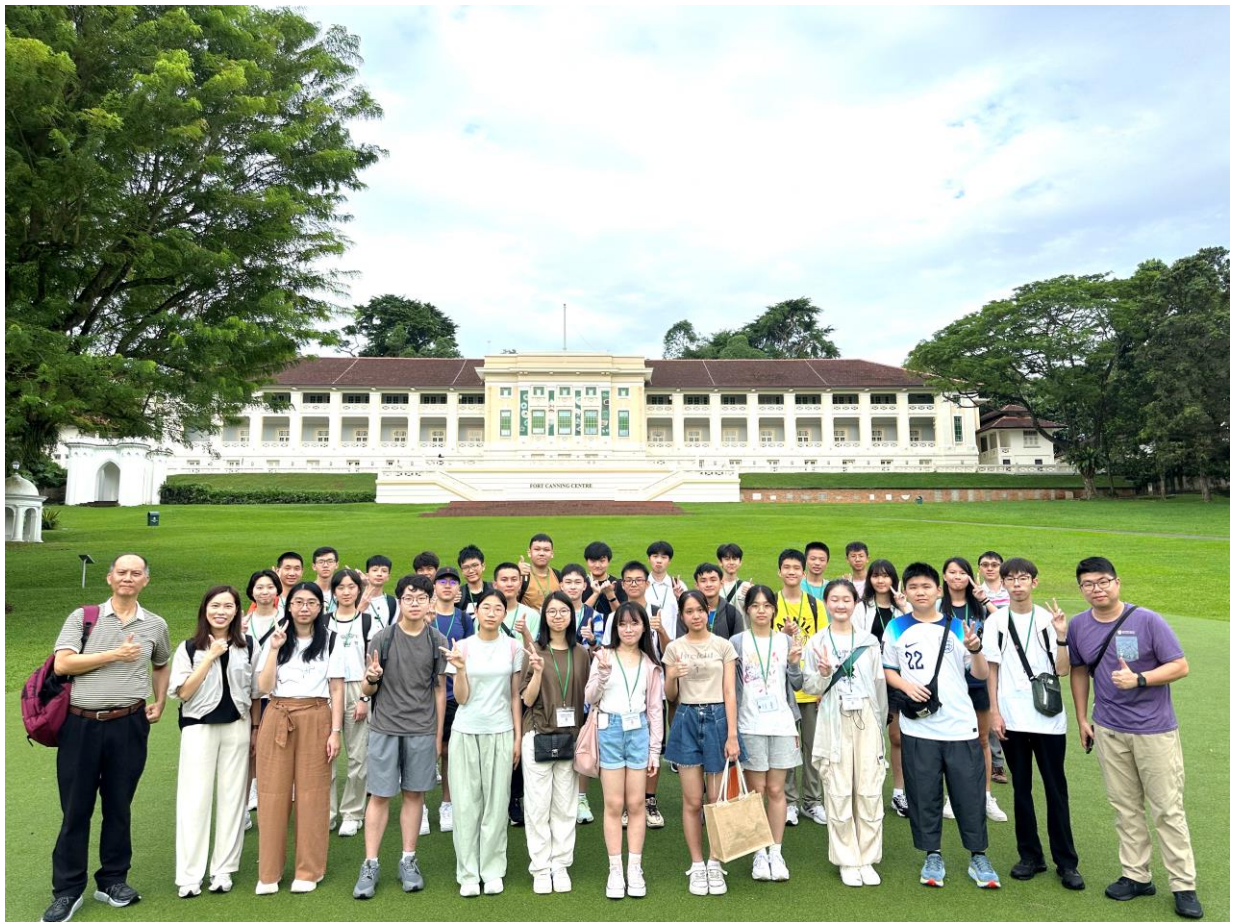
Students visit the Fort Canning Park on the last day