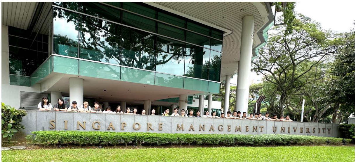
Students have lessons related to STEAM at the Singapore Management University