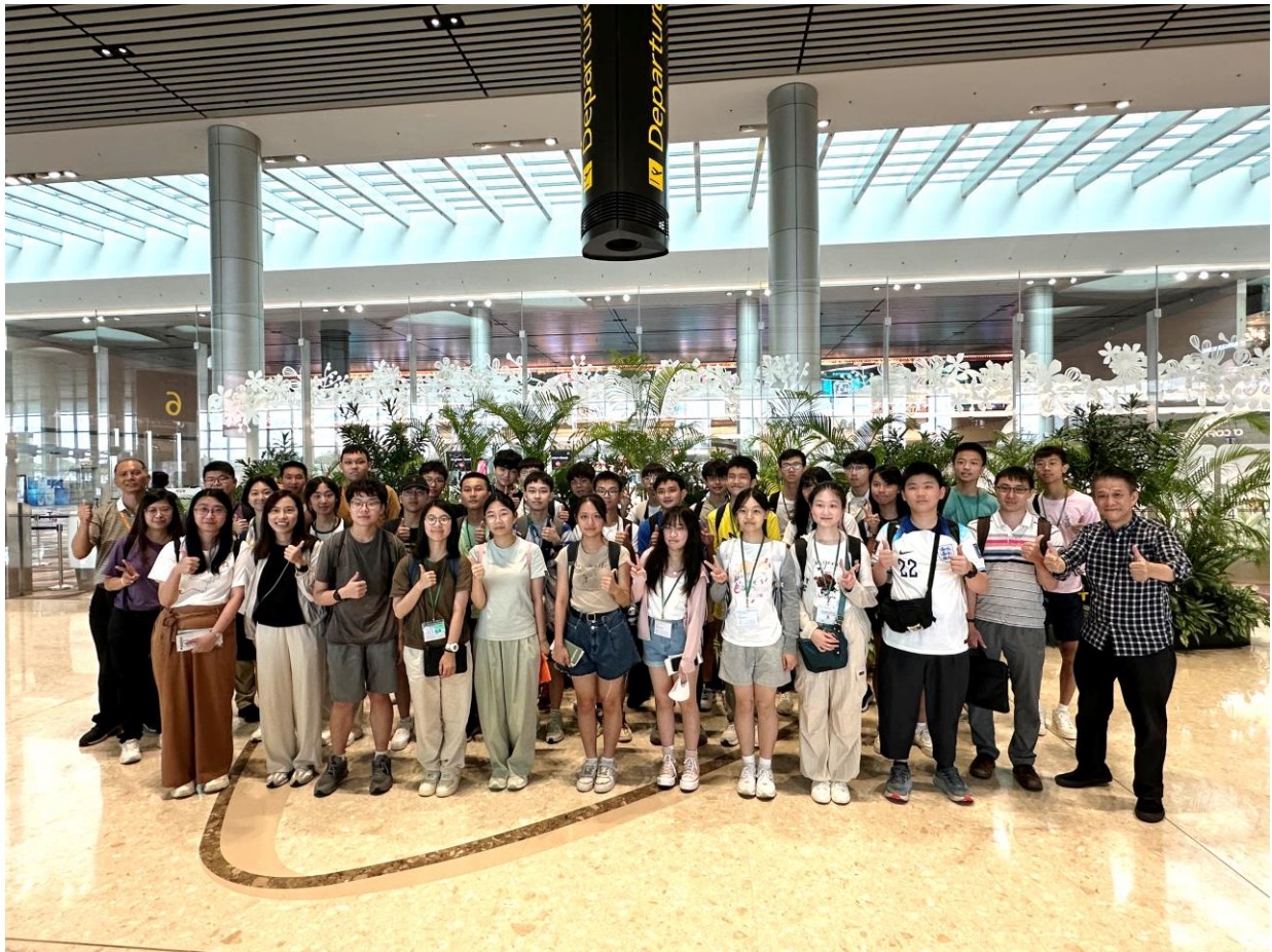
Students thank the local guide and the tour escort for the well-arranged tour and take a group photo together