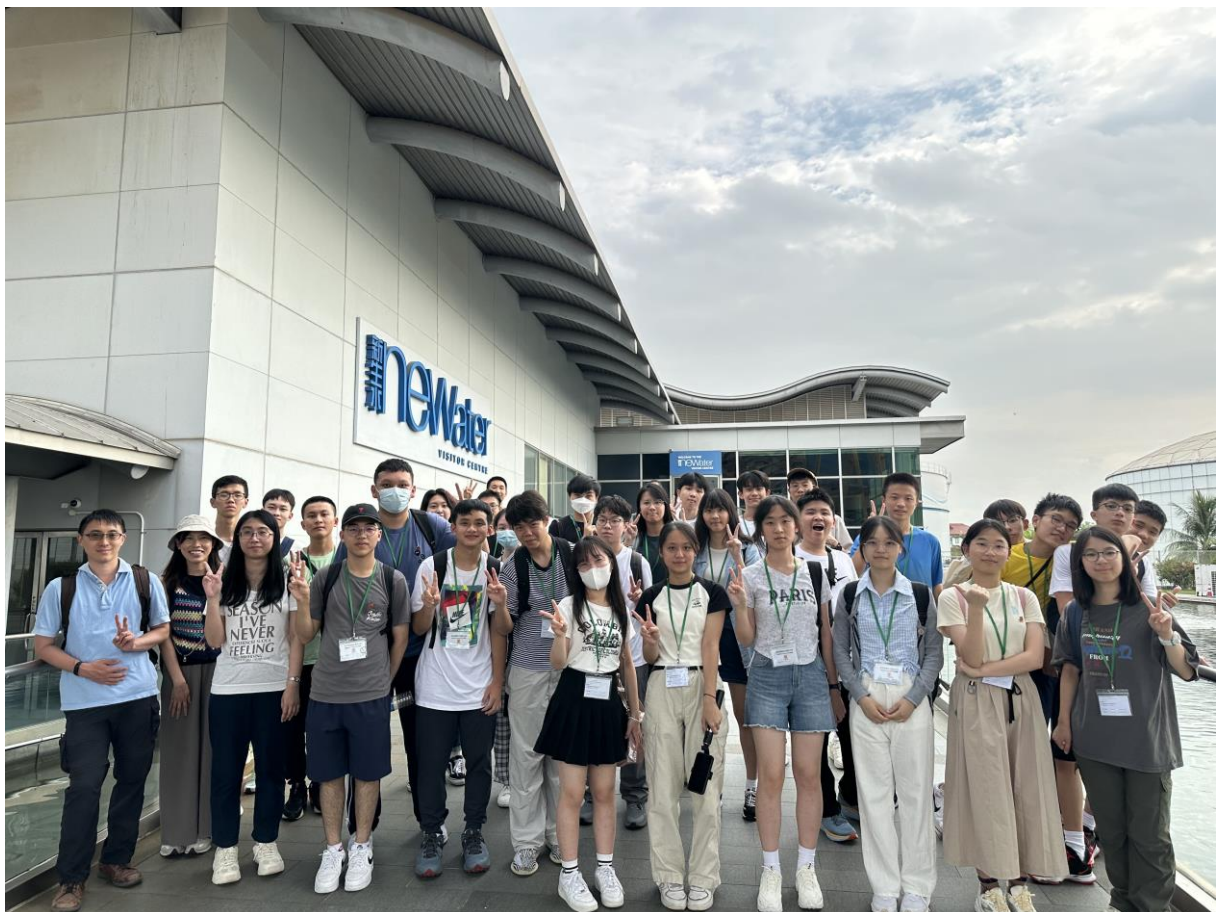
Students visit the NEWater Visitor Centre