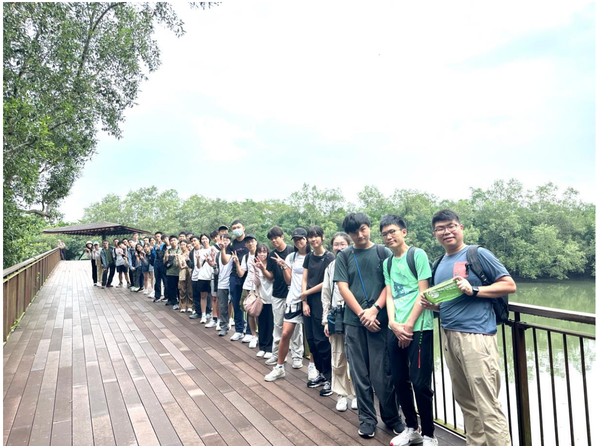
Students visit the Sungei Buloh Wetland Reserve