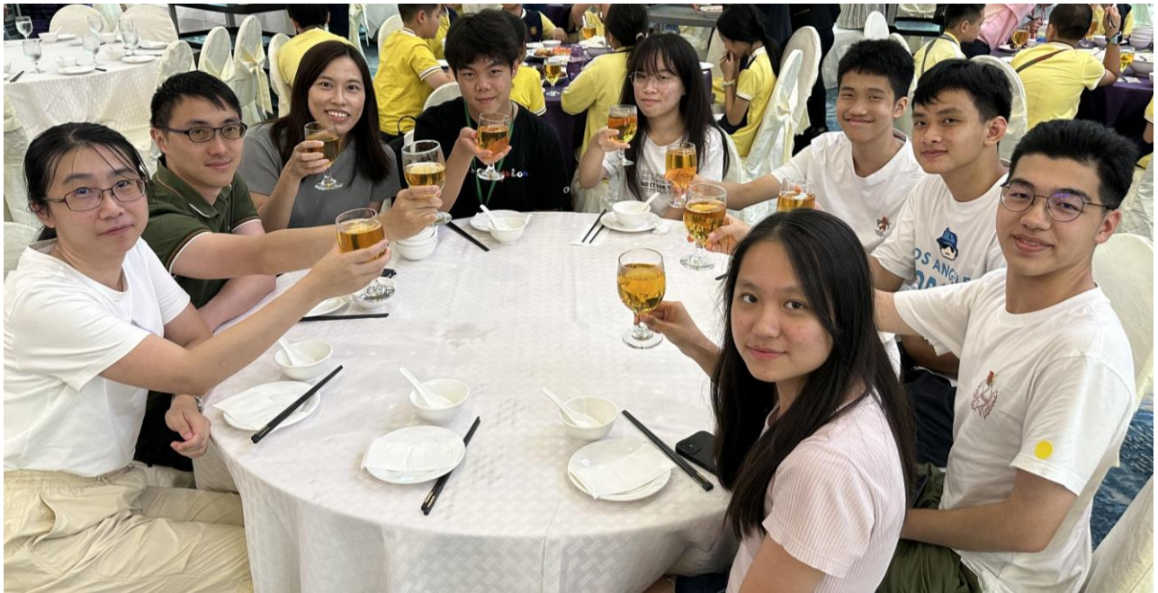
Students enjoy lunch with their teachers