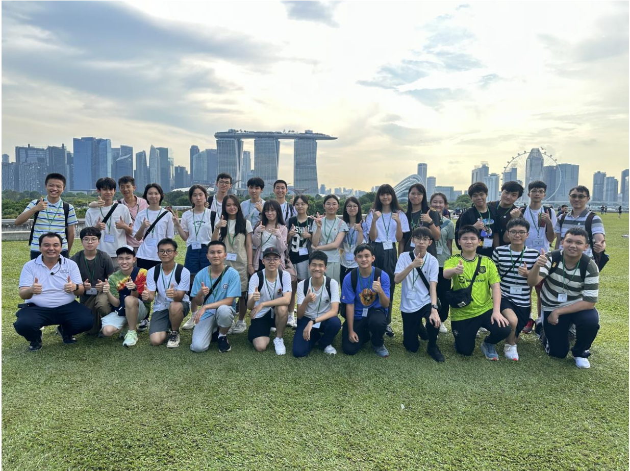
Group photo taken on the roof of the Sustainable Singapore Gallery