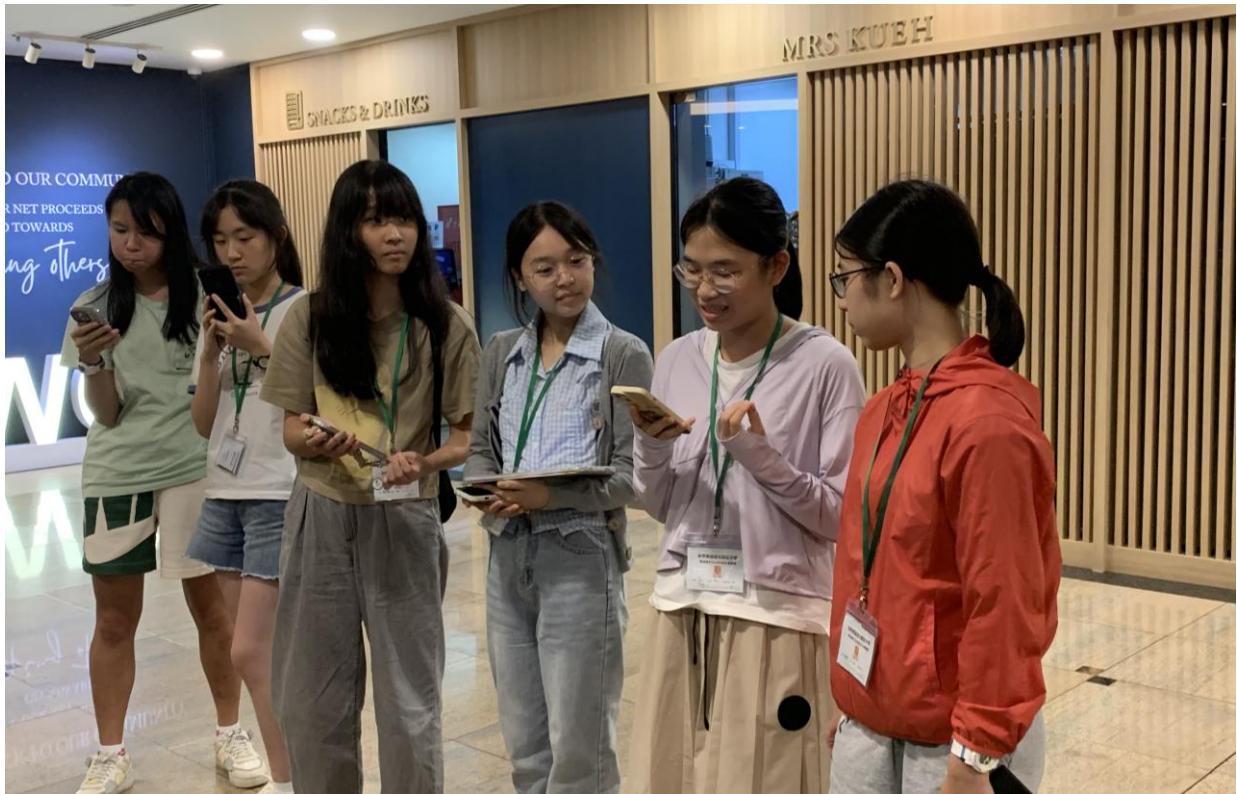
Students share what they have learnt during the trip