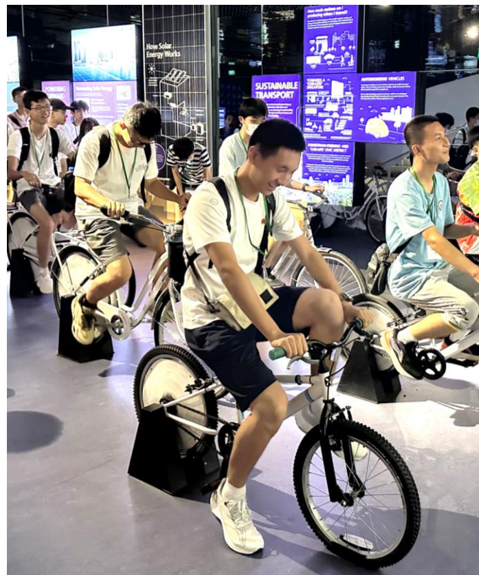
Students enjoy the cycling game at the Sustainable Singapore Gallery