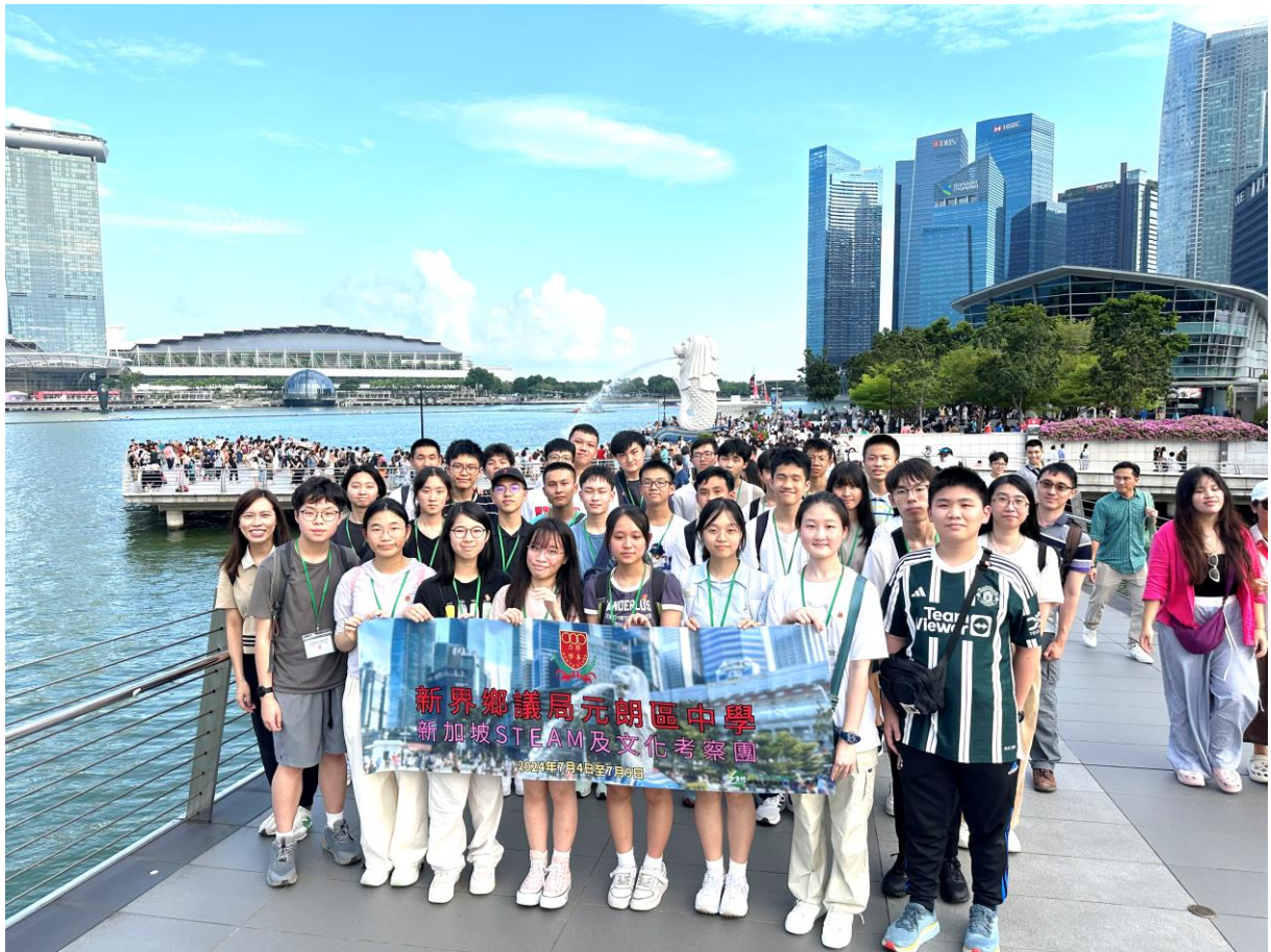
Group photo taken in front of Merlion