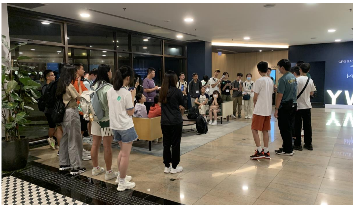
A sharing and debriefing session has been held on the last night in Singapore