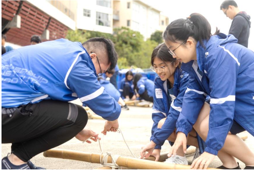
Students cultivate generic skills and collaborative skills in the training camp