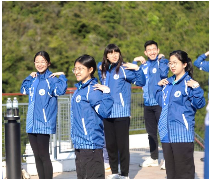
Our students enjoy their time with peers while gaining new skills and learning about anti-drug awareness at the camp