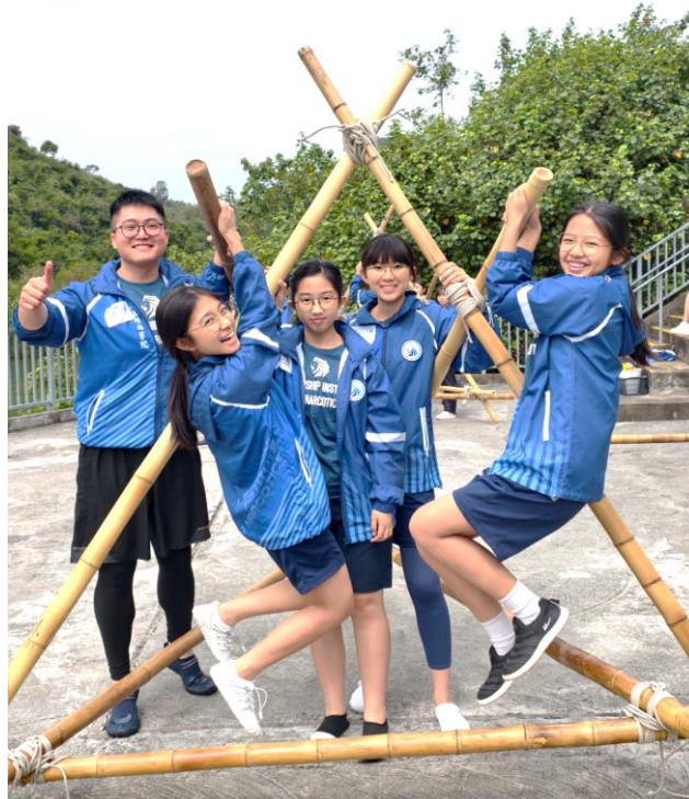
Our students collaborate to showcase their rapport and teamwork during one of the camp's missions