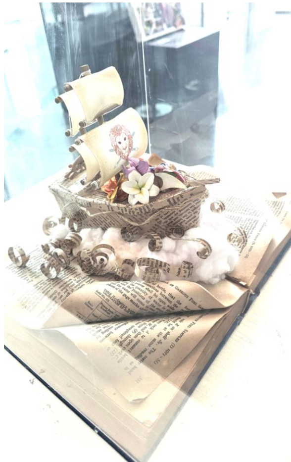
The interplay of materials and texture infuses the art piece with vibrancy and energy