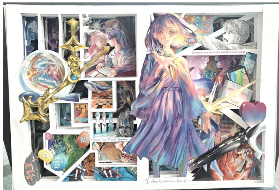
The intricate layering of manga scenes embodies a positive vibe of life