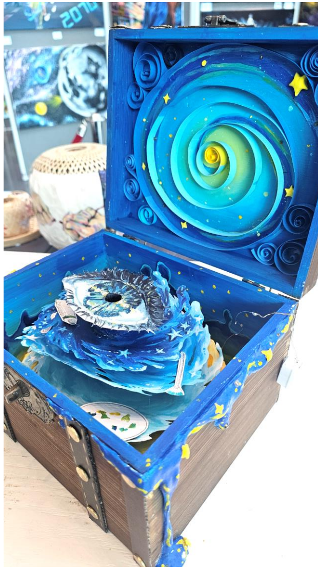
Through props including a treasure chest and lighting, the work showcases the starry sea