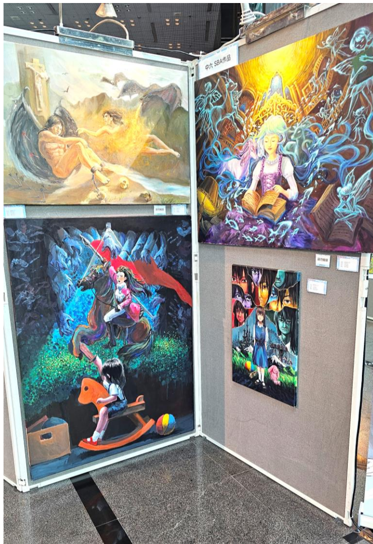
The sharp and bold hues reveal the vibrant spiritual world of the students