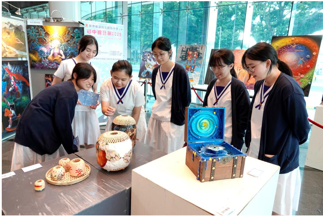
Students admire and learn from the creative works of their peers