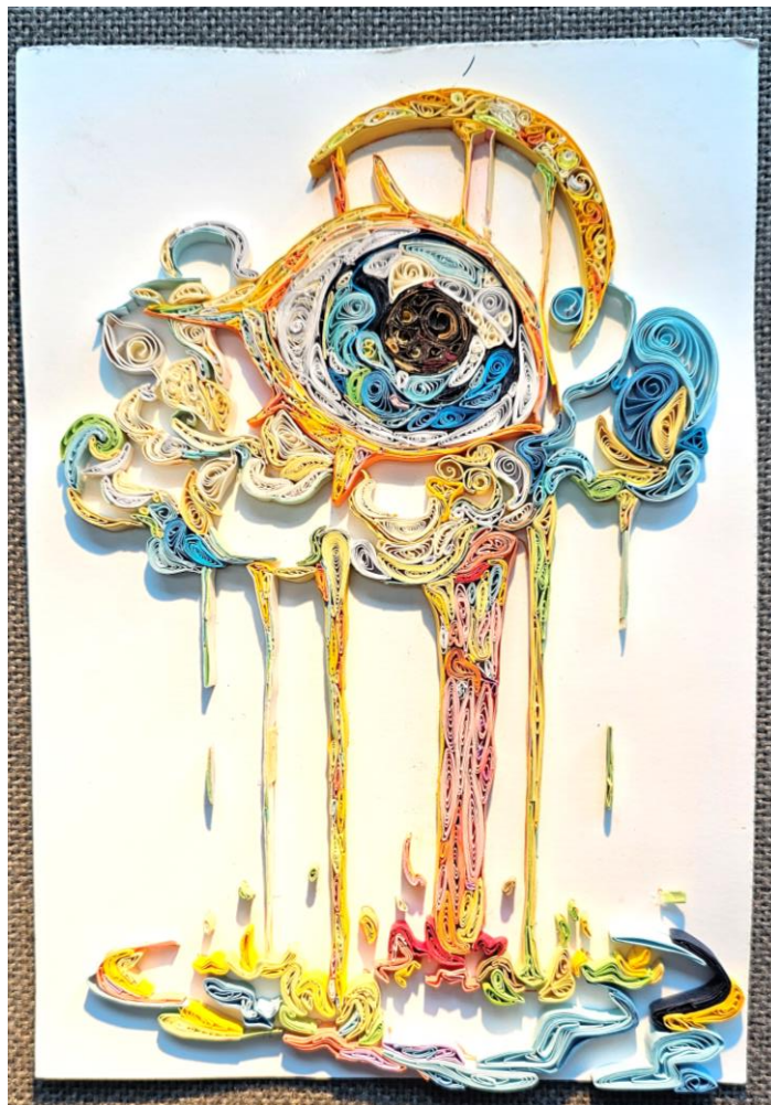
The inspiring 3-dimensional creation invites viewers to think beyond the ordinary