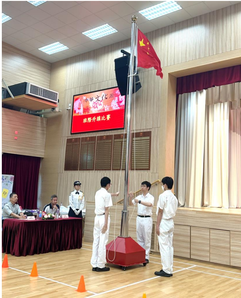
Inter-Class Flag Raising Competition

To deepen national security awareness and patriotic education, our school hosted its third annual Inter-Class Flag Raising Competition. This year's event featured Hong Kong Police College instructors as judges, with students demonstrating solemn precision in formation – their unified movements reflecting profound respect for the national flag. The stirring ceremony visibly embodied the participants' patriotism.