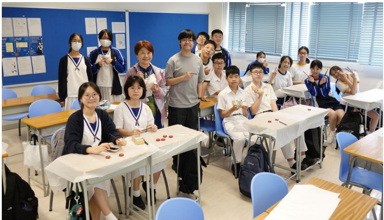
Students participate in seal carving workshop