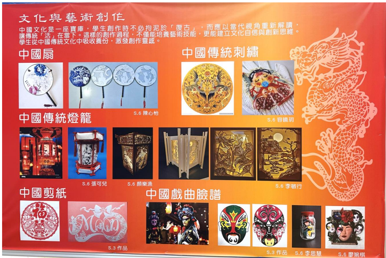
Departments craft creative displays blending visuals and text, highlighting National Security and unique Chinese cultural heritage