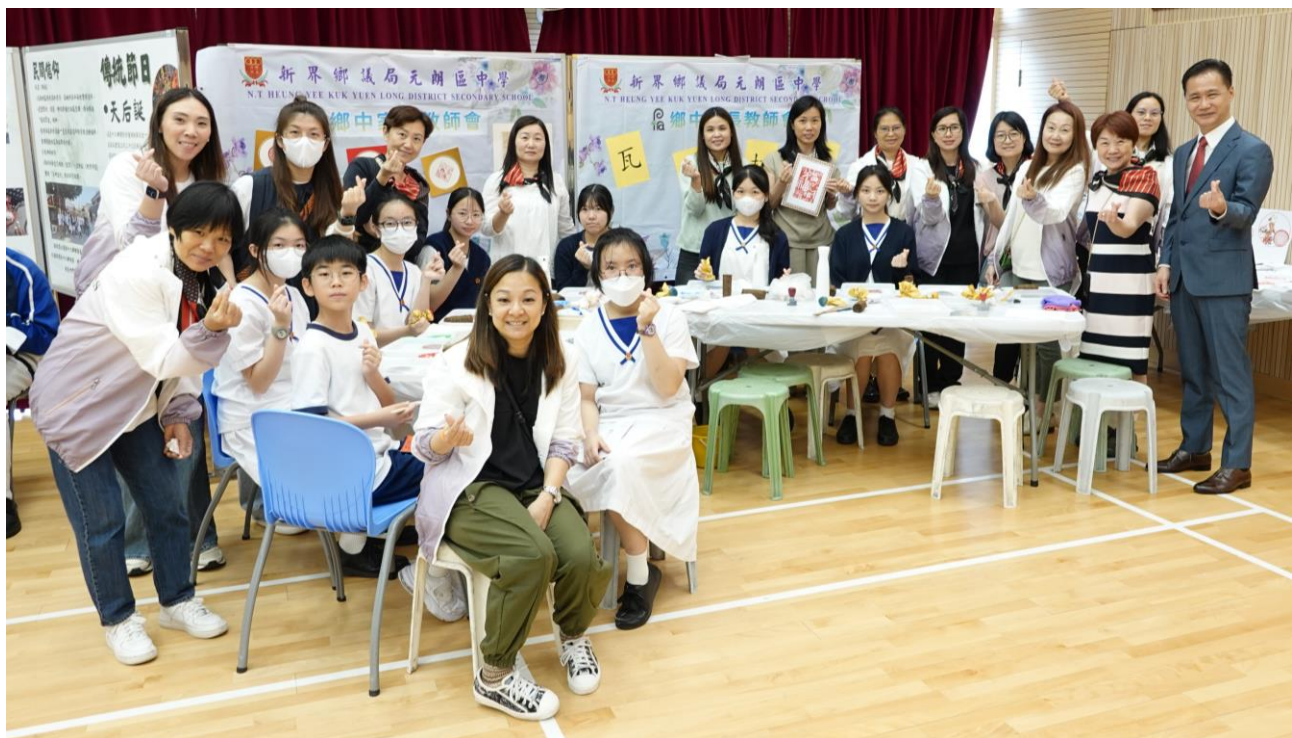
The Parent-Teacher Association members devote their full efforts to instructing students in creating roof-tile rubbing artworks, preserving this traditional craft