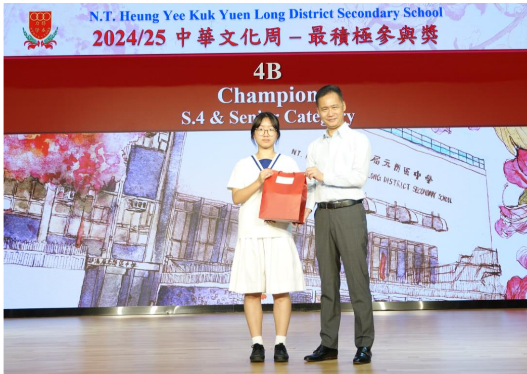
Most Active Participation Award – Senior Category Champion:4B