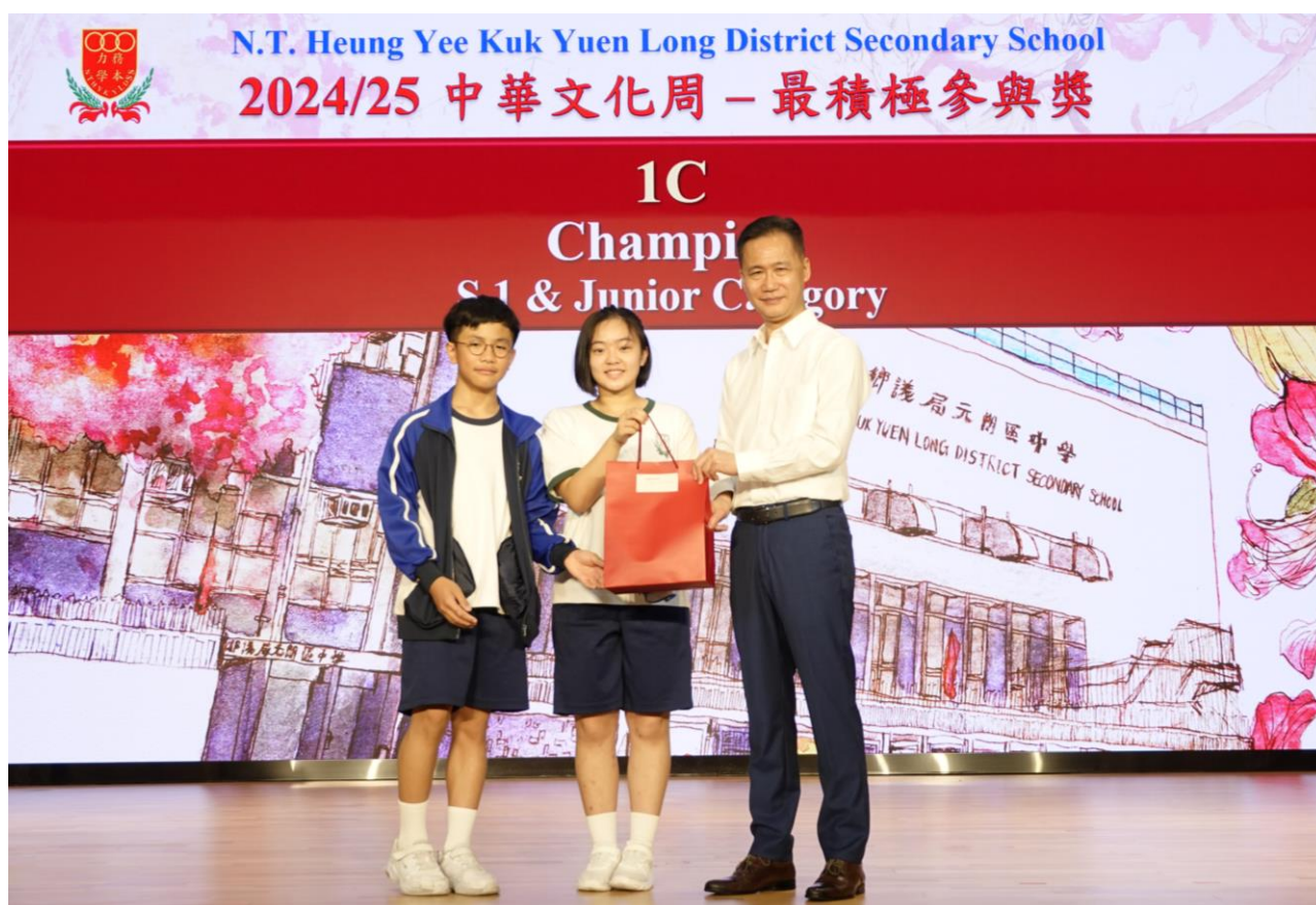
Most Active Participation Award – Junior Category Champion: 1C