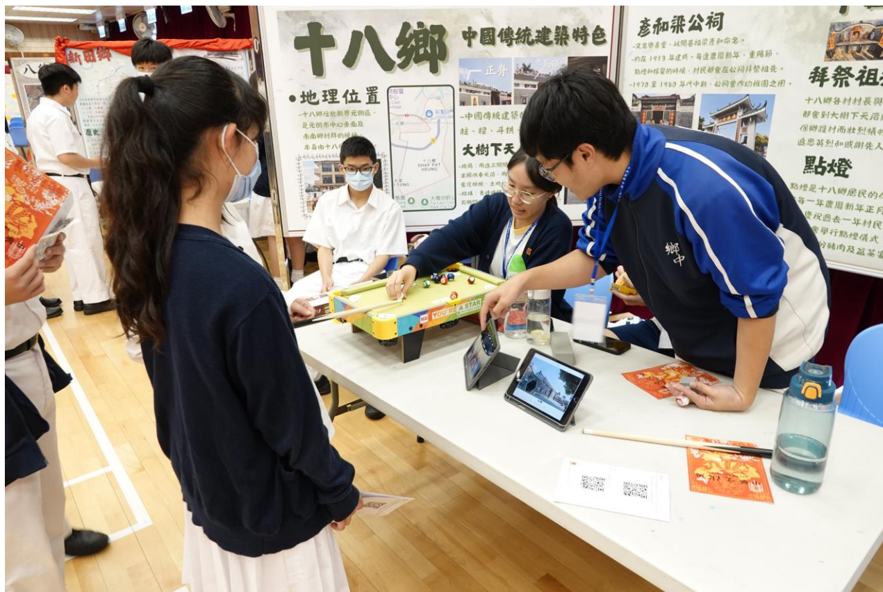
Students explore Shap Pat Heung heritage through engaging interactive games