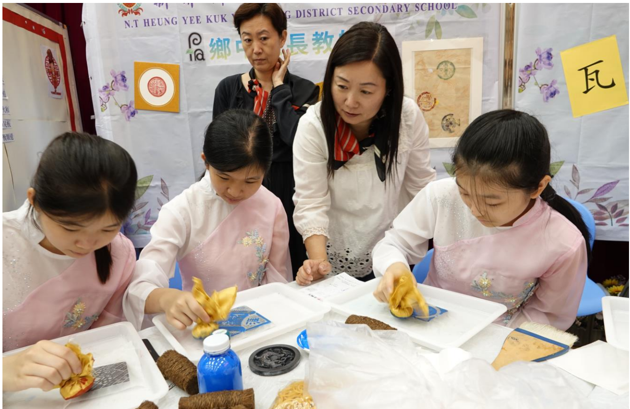
The Parent-Teacher Association members dedicate themselves to teaching students how to create eaves tile rubbings as traditional art pieces