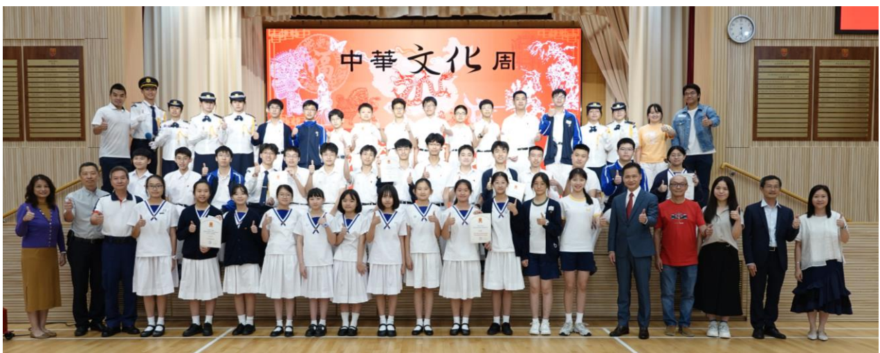
Group photo after Inter-Class Flag Raising Competition