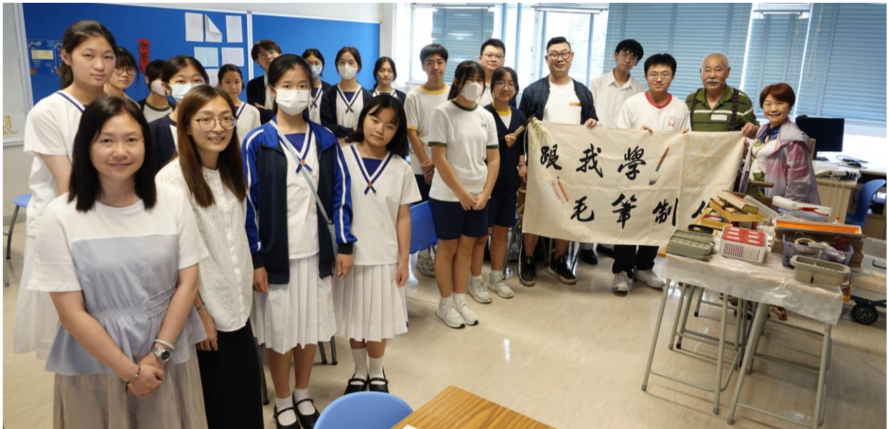
Teachers and students participate in brush-making workshop

In the Chinese Seal Carving Workshop, students carved unique designs into stone, experiencing the beauty of this traditional craft. The Brush Making Workshop guided students through the process of selecting, combing, and binding brush hairs, instilling an appreciation for the artisan spirit of pursuing excellence.