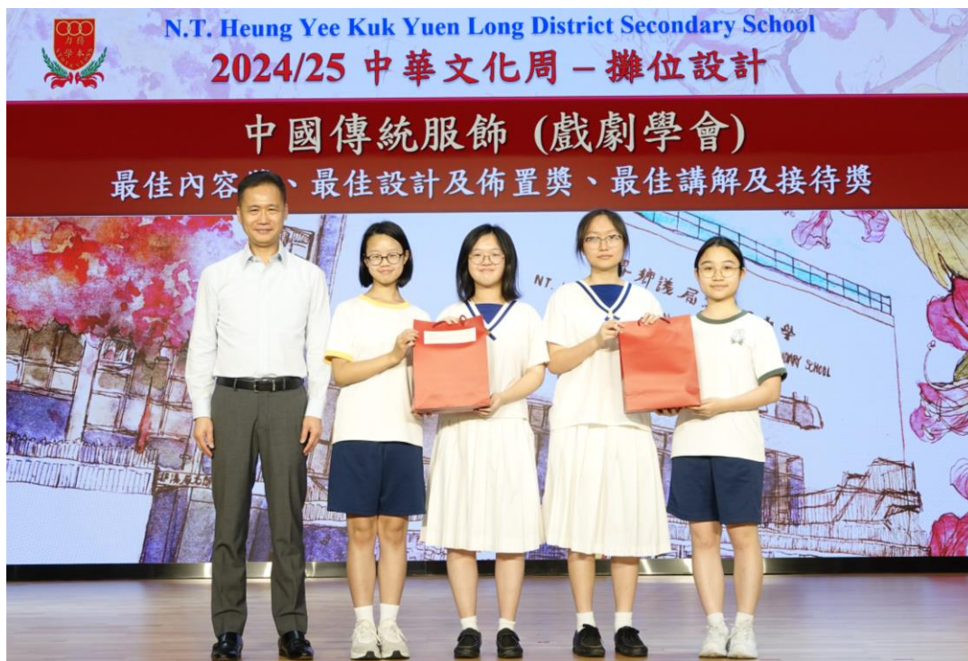
Drama Club gets the Best Content for Booth Production Awards, the Best Design and Decoration Award and the Best Explanation and Reception Award

This Chinese Culture Week represented the collective dedication of our entire school community, with strong support from the School Board and Parent-Teacher Association. Through hands-on participation, practical workshops, and reflective learning, students not only discovered the splendor of Chinese civilization but also planted seeds for cultural continuity. New Territories Heung Yee Kuk Yuen Long District Secondary School remains committed to promoting Chinese culture through diverse initiatives – nurturing future leaders who are informed and responsible citizen with a sense of national and global identity, ensuring the perpetual blossoming of Chinese cultural heritage!