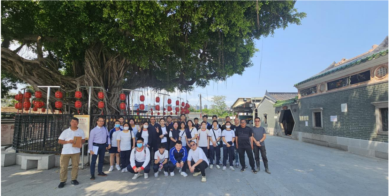
4A: Shap Pat Heung

Under the guidance of School Council members, all S4 students were divided into groups to explore the Six Heungs in Yuen Long (Shap Pat Heung, San Tin Heung, Pat Heung, Ha Tsuen Heung, Kam Tin Heung, and Ping Shan Heung). They visited the ancestral halls, study halls, ancient temples, and cultural landmarks in villages. Students touched the weathered textures of century-old walls, listened to local elders share stories, and deepened their understanding of the enduring legacy of Chinese cultural heritage.