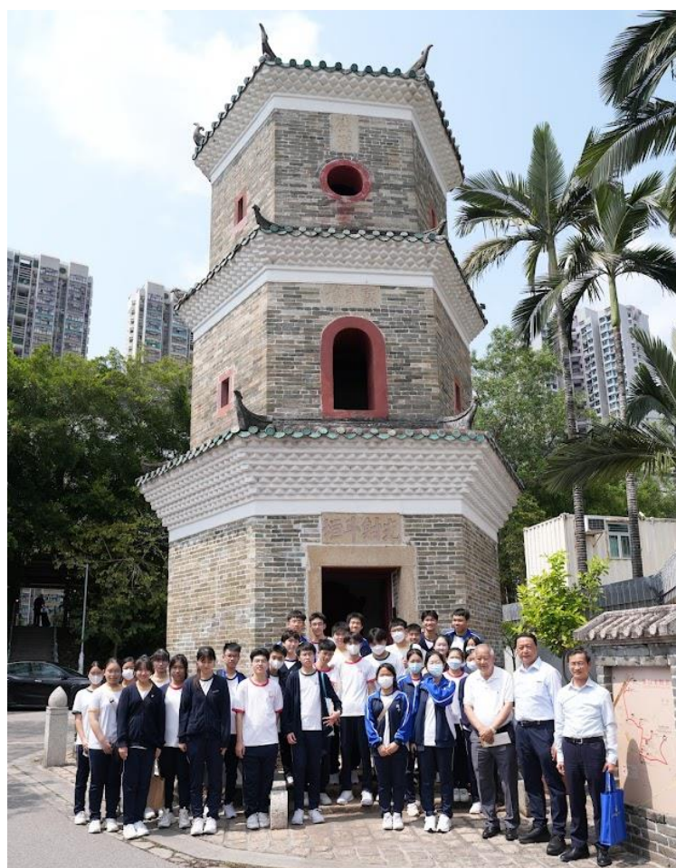
4F: Ping Shan Heung