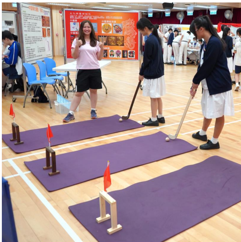
Students experience 'chuiwan', a traditional Chinese ball game with centuries of history