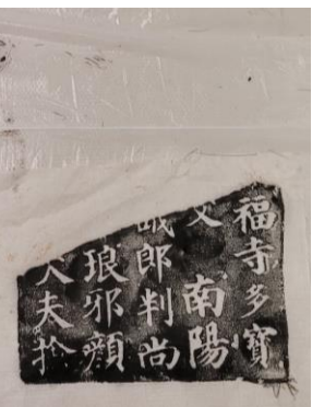
The Chinese Club committee members teach students about the history of Chinese character printing and the distinctive features of famous calligraphy works, while guiding everyone in the art of creating rubbings