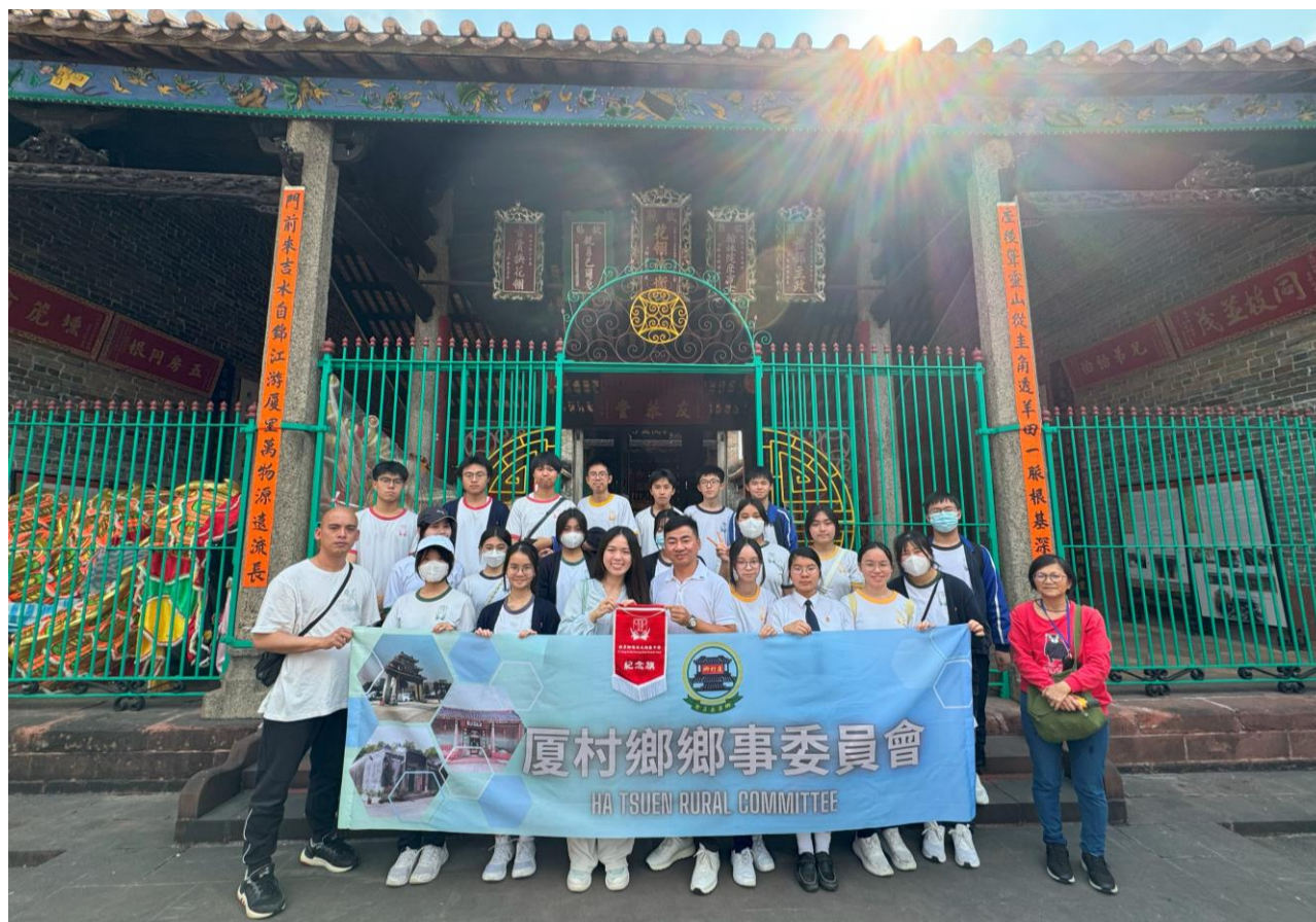
4D: Ha Tsuen Heung