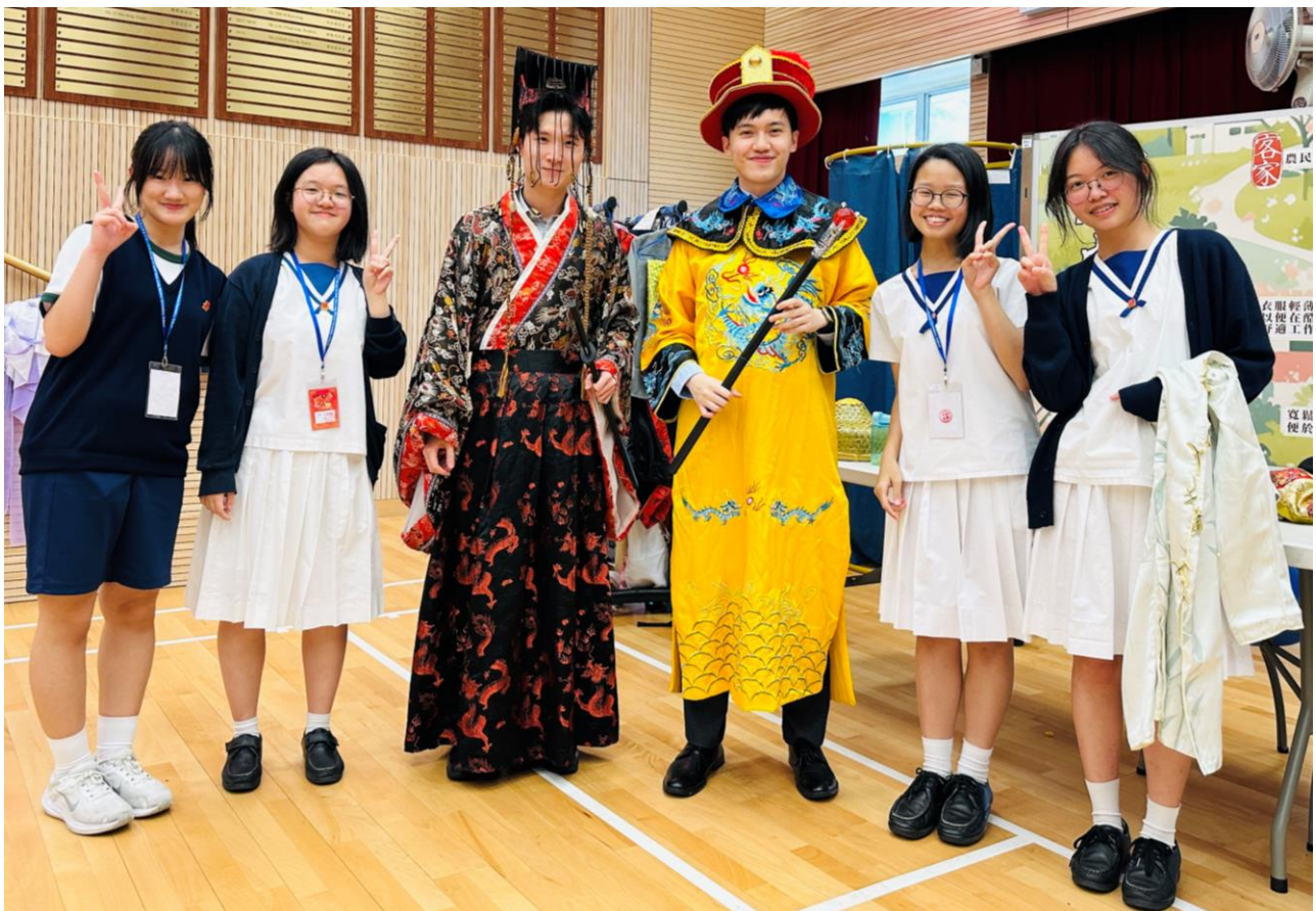
Teachers and students bring history to life through immersive role-playing as ancient figures