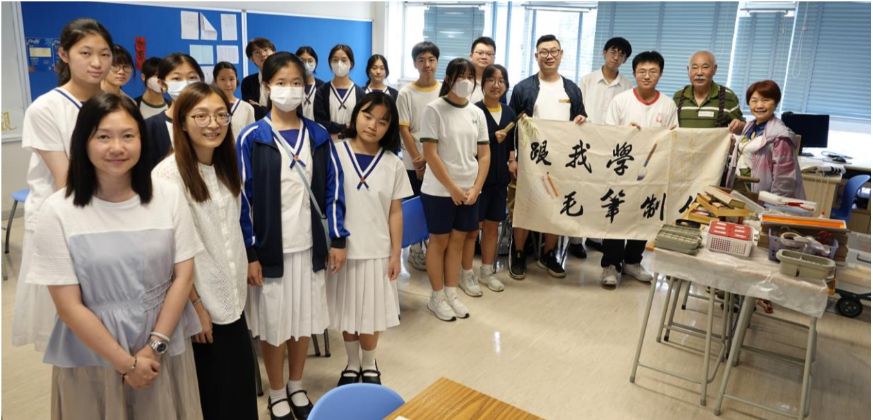
Teachers and students participate in brush-making workshop

In the Chinese Seal Carving Workshop, students carved unique designs into stone, experiencing the beauty of this traditional craft. The Brush Making Workshop guided students through the process of selecting, combing, and binding brush hairs, instilling an appreciation for the artisan spirit of pursuing excellence.