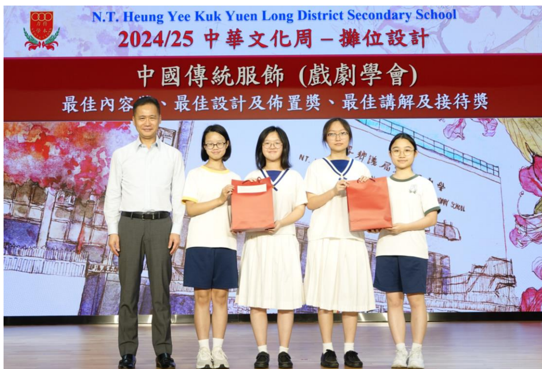
Drama Club gets the Best Content for Booth Production Awards, the Best Design and Decoration Award and the Best Explanation and Reception Award

This Chinese Culture Week represented the collective dedication of our entire school community, with strong support from the School Council and Parent-Teacher Association. Through hands-on participation, practical workshops, and reflective learning, students not only discovered the splendor of Chinese civilization but also planted seeds for cultural continuity. New Territories Heung Yee Kuk Yuen Long District Secondary School remains committed to promoting Chinese culture through diverse initiatives – nurturing future leaders who are informed and responsible citizen with a sense of national and global identity, ensuring the perpetual blossoming of Chinese cultural heritage!