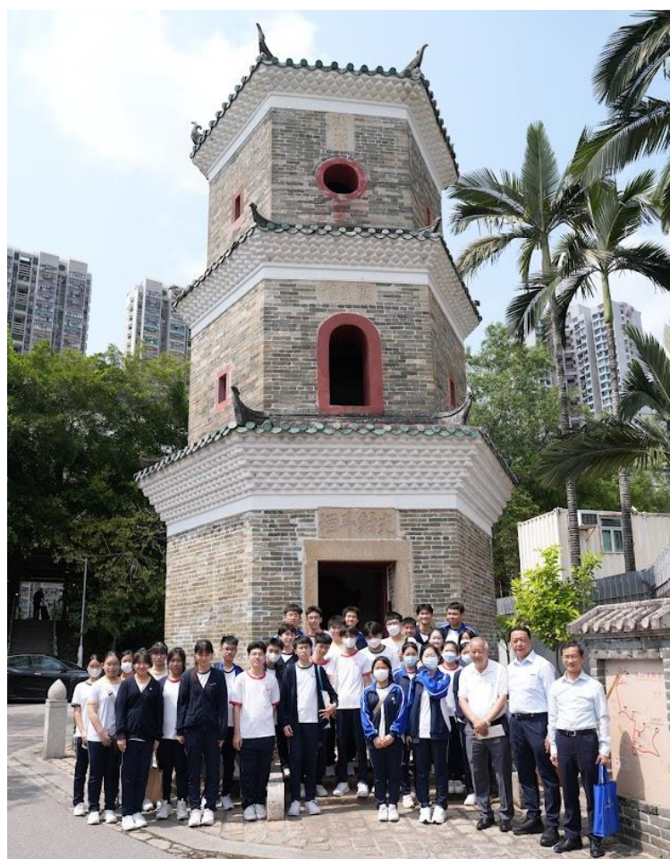
4F: Ping Shan Heung