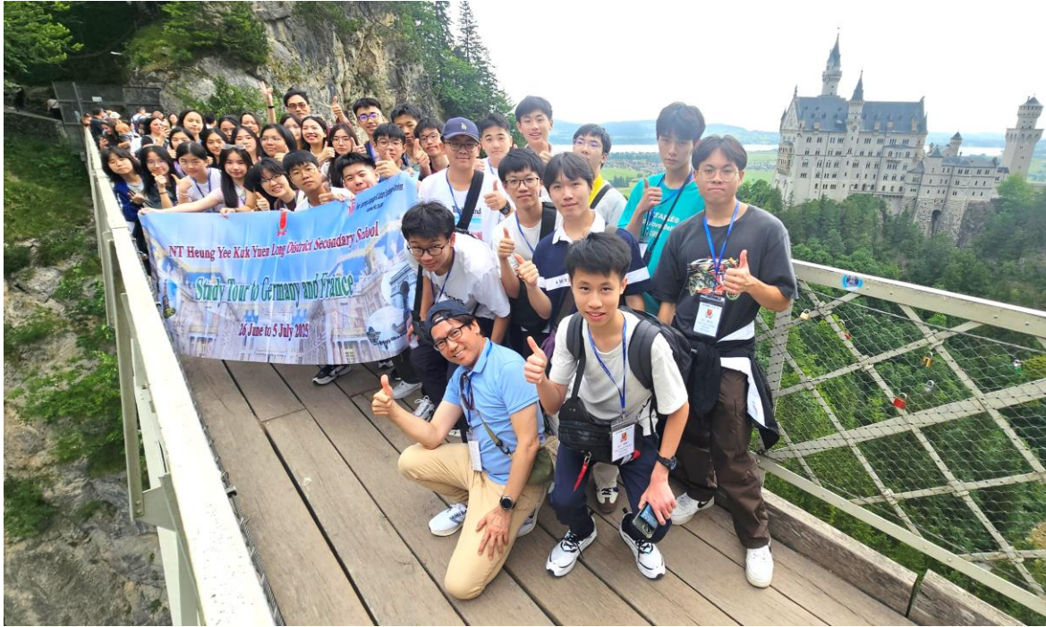
Overlooking Neuschwanstein Castle from Marienbrücke (Mary's Bridge), the view perfectly captures the harmony between the castle and its natural surroundings