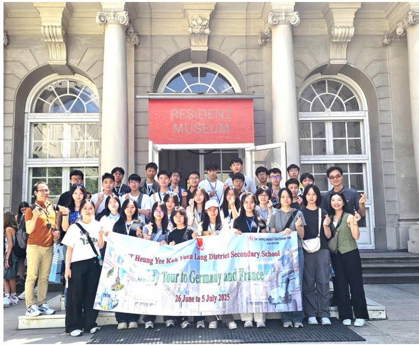
Teachers and students take photos outside the Royal Palace in Munich