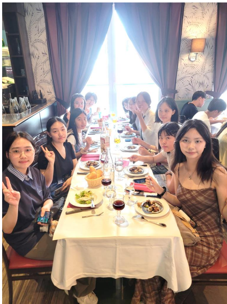
Students enjoy a rich French feast, tasting authentic escargot!