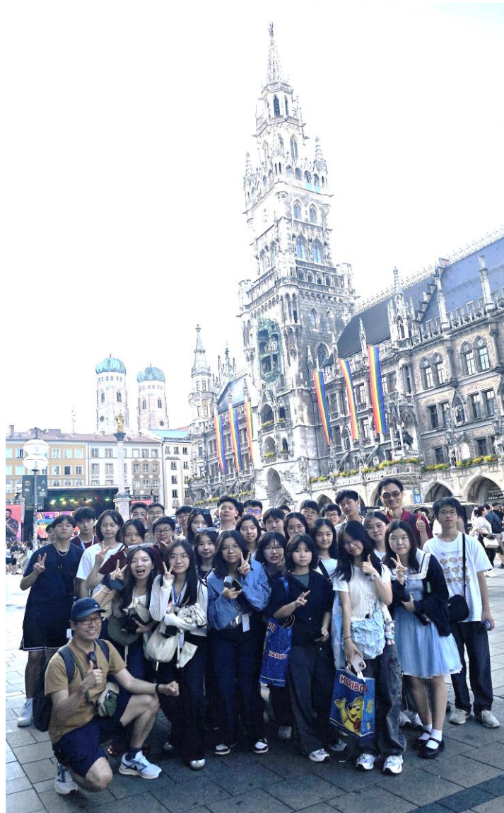
Students visit the famous Marienplatz