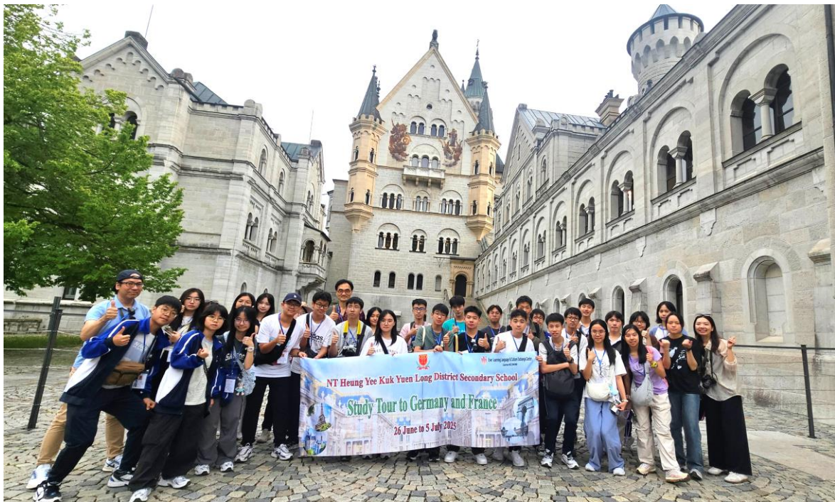
Teachers and students at Neuschwanstein Castle