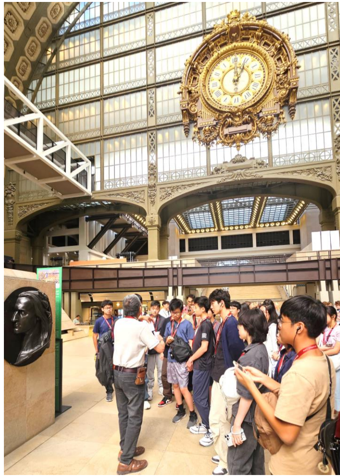
Students listen attentively to the docent's explanation at the Musée d'Orsay