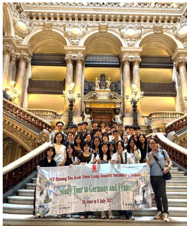
Visiting the Paris Opera House to admire its stunning neo-Baroque architecture