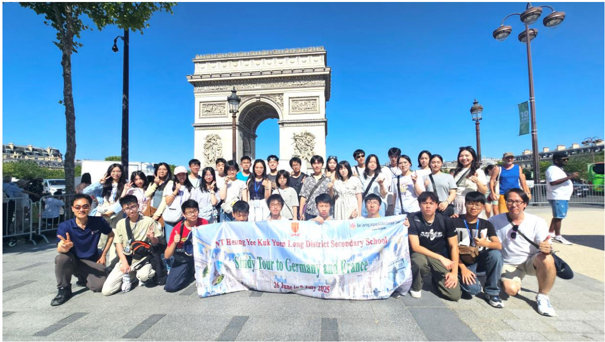
Teachers and students pose for a group photo in front of the Arc de Triomphe.