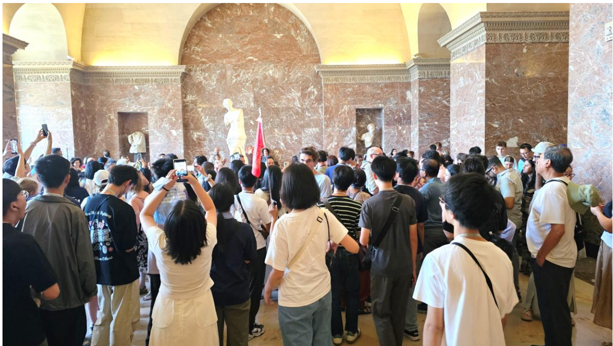
Students explore the Louvre Museum's famous exhibit featuring the Venus de Milo