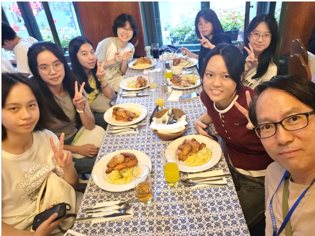
Students enjoy authentic German cuisine