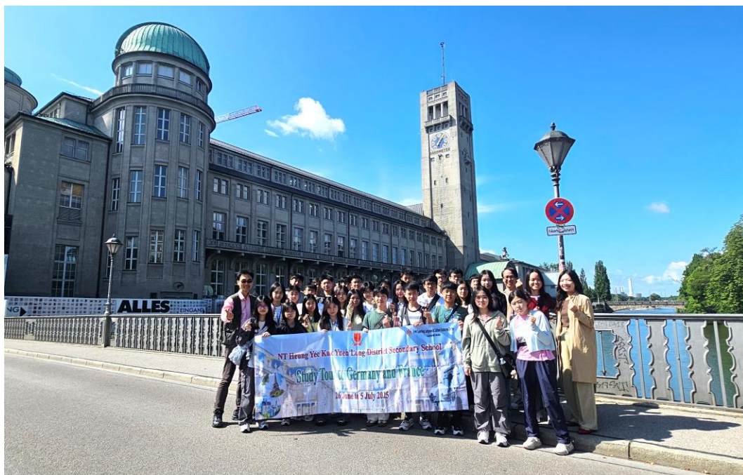
Teachers and students visiting the Deutsches Museum in Munich