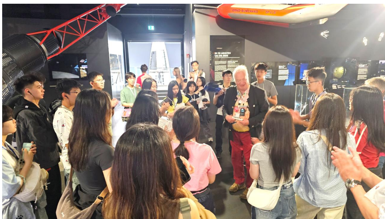
Students listen attentively to the docent's explanation at the Deutsches Museum, witnessing the perfect integration of science, technology, engineering, art, and mathematics (STEAM)