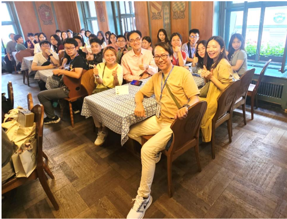
Students looking forward to the authentic German cuisine