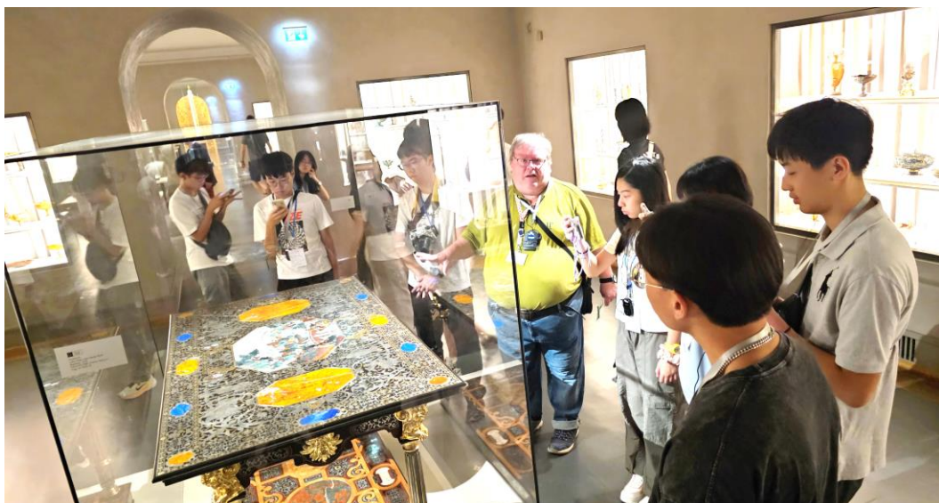
Students visit Munich's Royal Palace, admiring its architecture, interiors, and historic royal collections