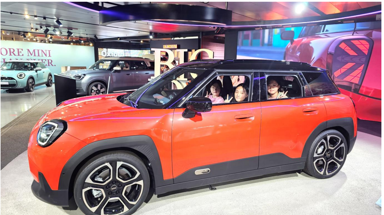
Students visit BMW World and test-drive the latest models, gaining a deeper appreciation for the innovative technology and engineering behind them.