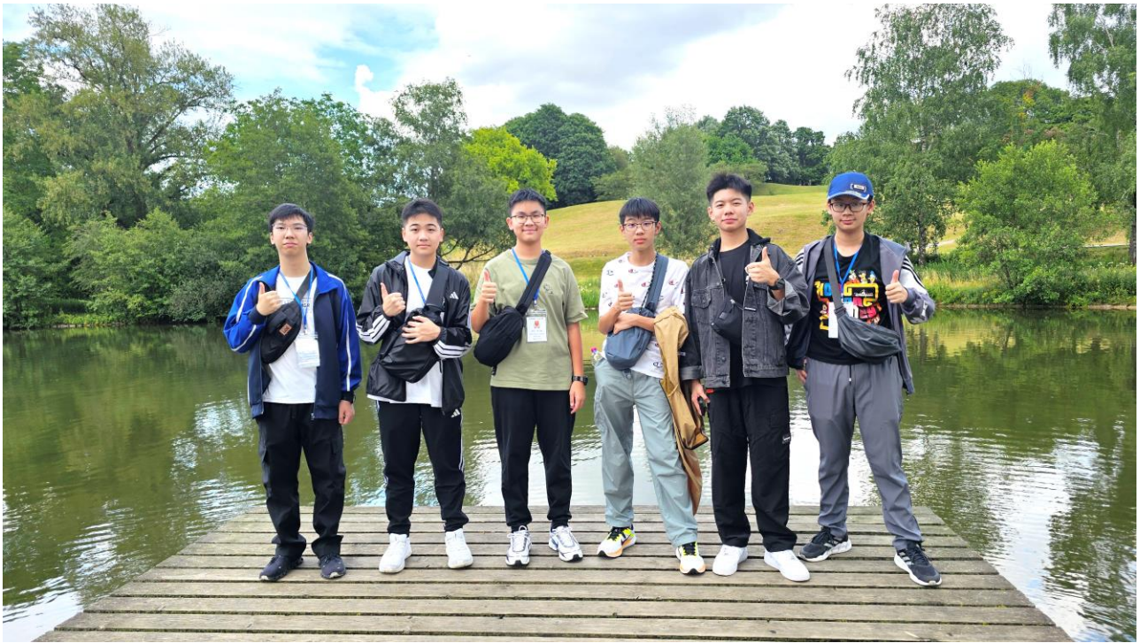
Secondary 3 students pose for a group photo at the Olympic Park in Munich