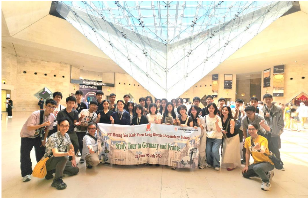
Group photo at the Louvre's iconic inverted pyramid