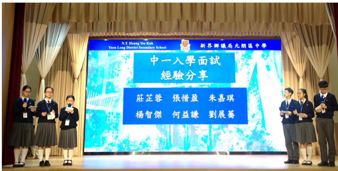
Students share tips and experience of attending interviews with primary school pupils