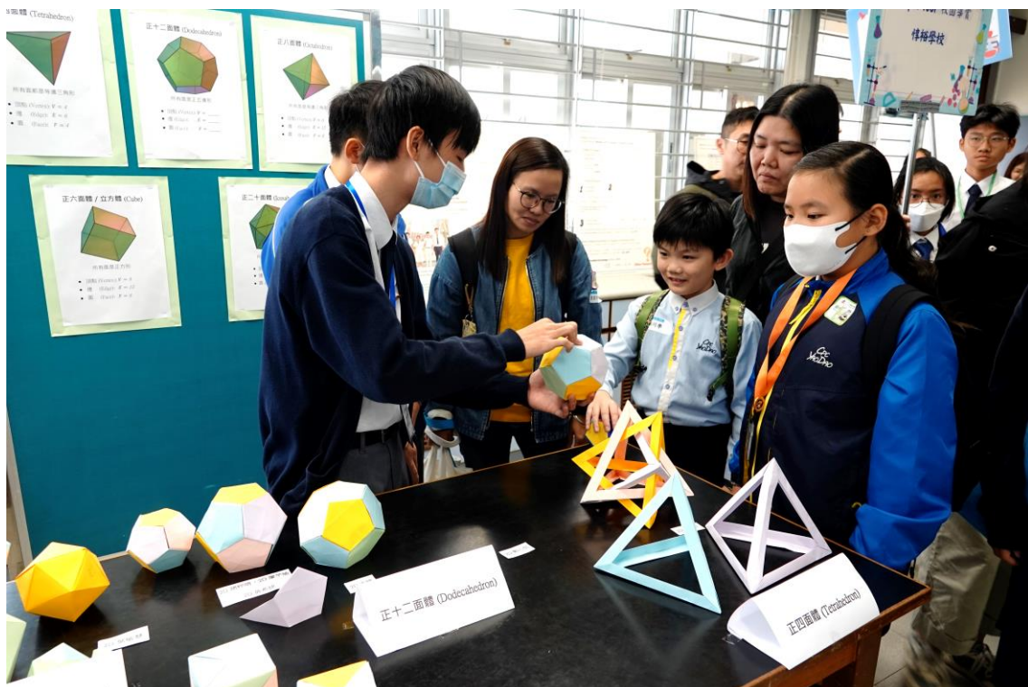
Primary school pupils enjoy the STEAM project work - Mathematical origami