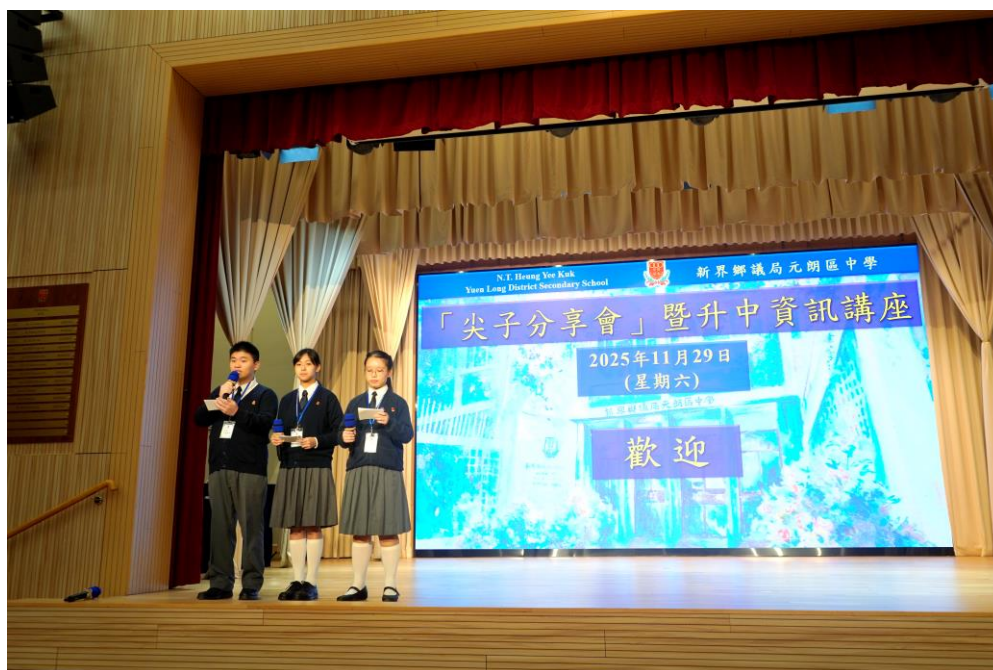
High-flyer MCs announce the start of the event

Last but not least, there was a school tour led by our student representatives and Parents and Teachers Association helpers to visit the school campus. Parents and students observed science experiments and gained hands-on experience with several STEAM and digital education projects. They then went to our Visual Arts Room to appreciate a variety of students' artwork and visited our Technology for Life workshop to see students' design and technology projects. This allowed all participants to get a taste of Heung Chung's school life.