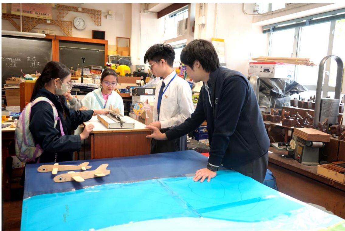
Primary school pupils listen attentively as our students share the learning outcomes of their Technology for Life projects