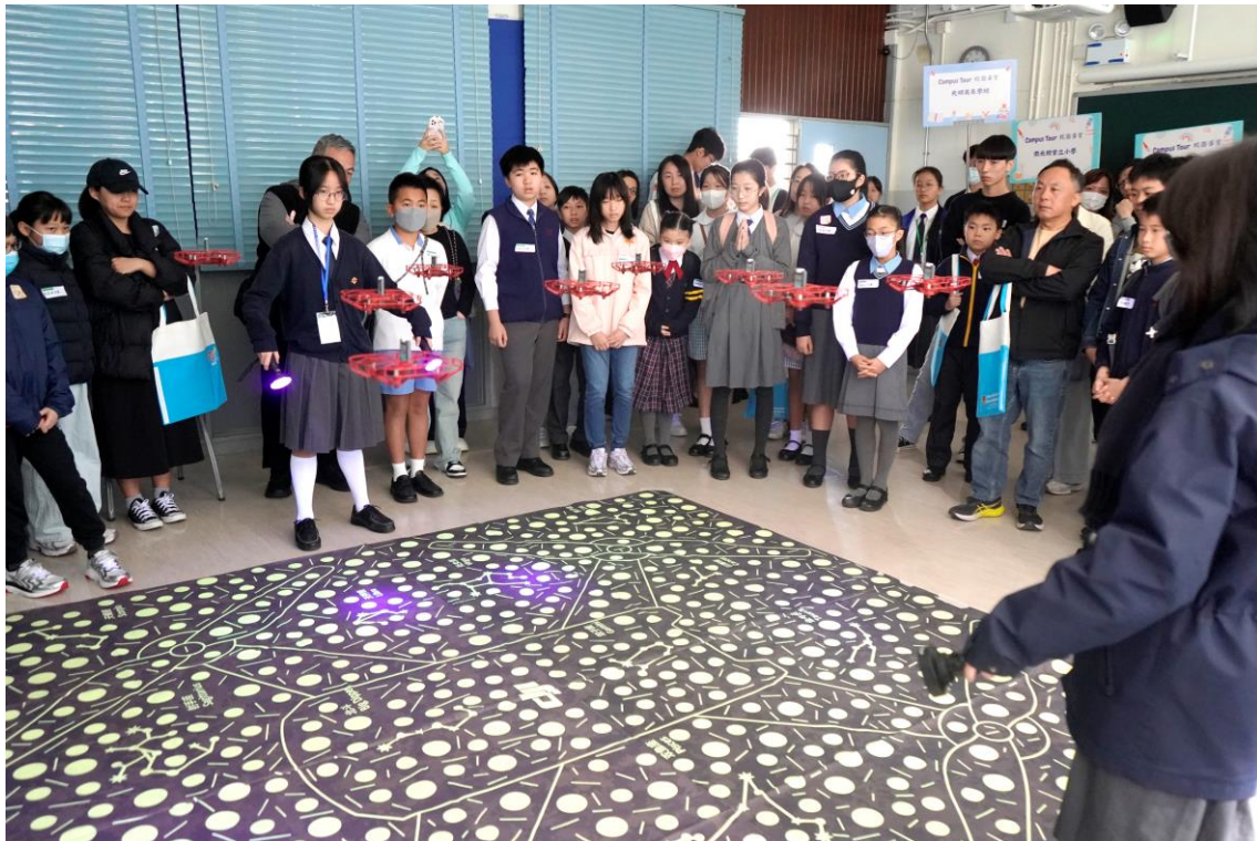
Primary school pupils engage in the drone flying show