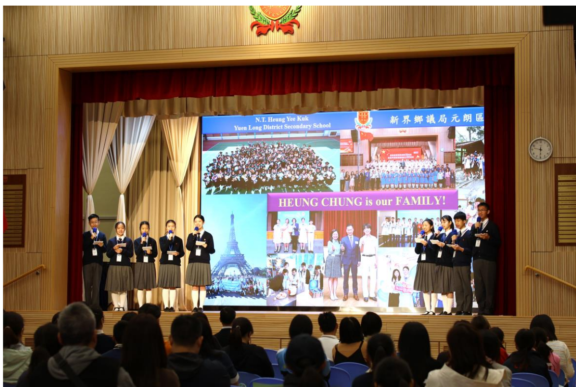
Students give a presentation on their fruitful learning experience