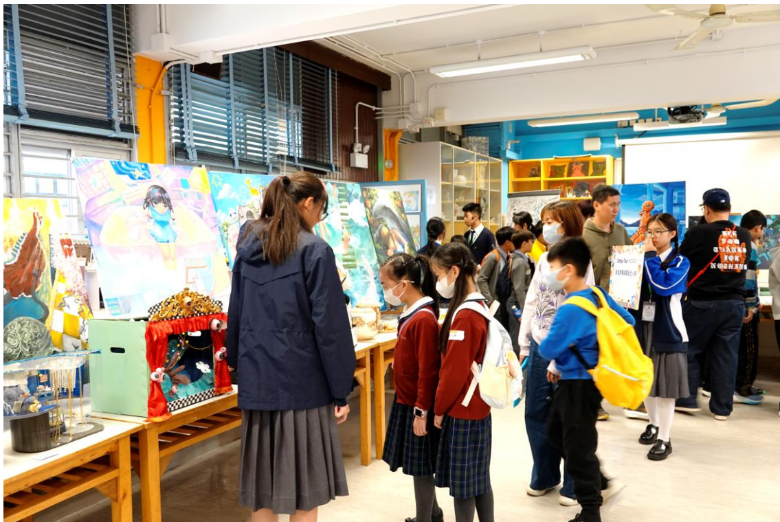
Primary school pupils appreciate the visual arts display