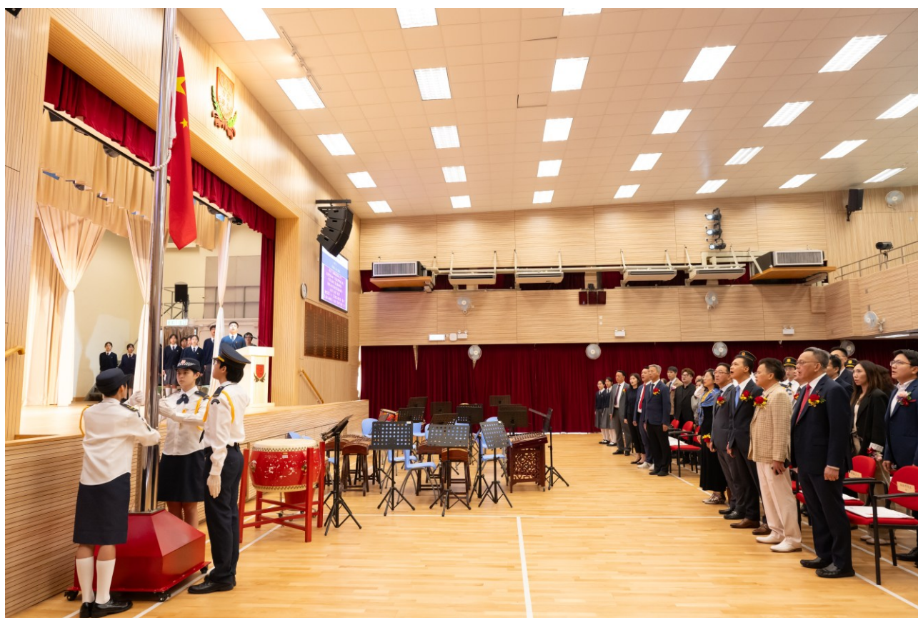
Our solemn Flag-Raising Ceremony