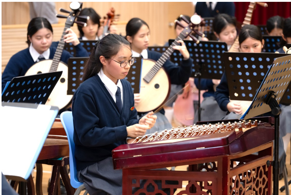
The Chinese Orchestra plays 'We are Chinese'