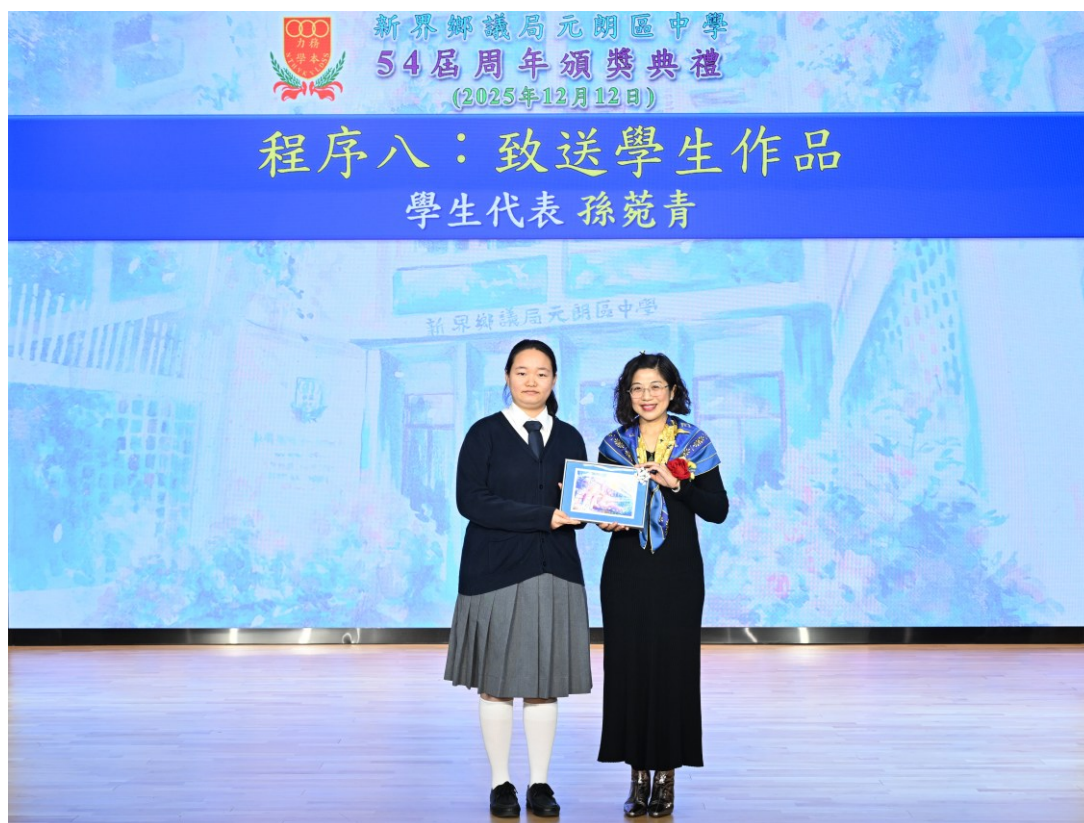
SUN Wat-ching Sunny presents a token of appreciation to the Guest of Honour