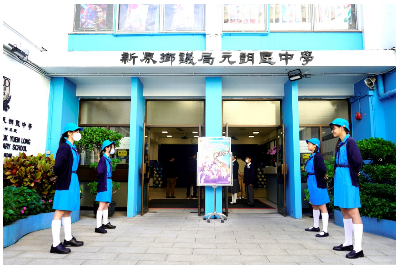
Girl Scouts greet guests at the school entrance, showing respect and warmth