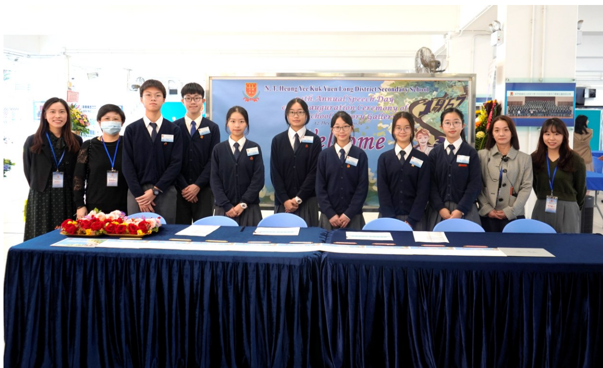
Our Reception Team members warmly greet guests at the covered playground