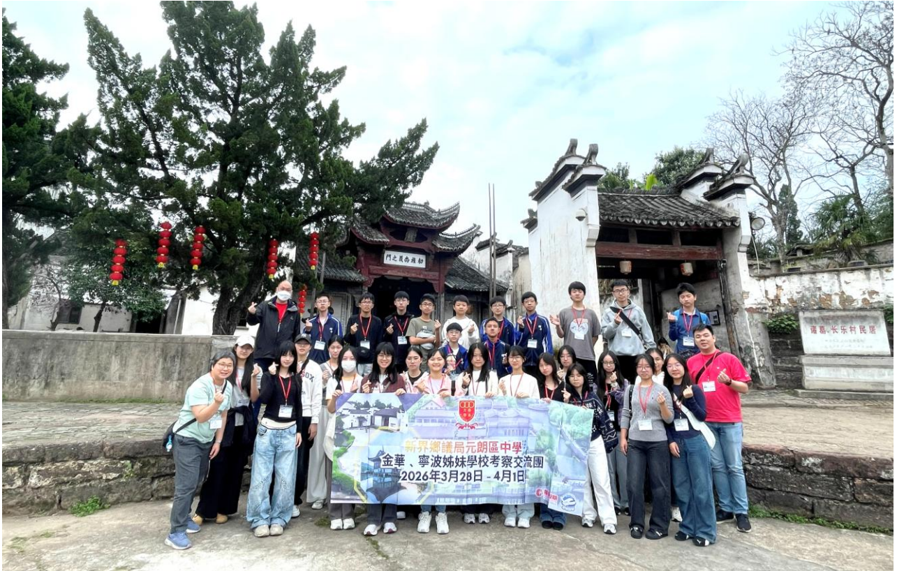
Our teachers and students take a group photo at Zhuge Bagua Village