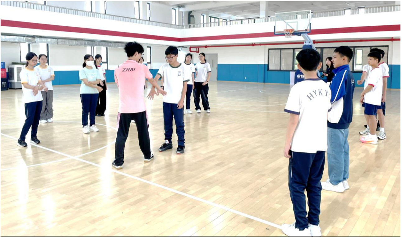
A Physical Education teacher from the Jinhua No. 2 High School provides instruction in traditional Chinese martial arts, inspiring our students' interest in Chinese culture