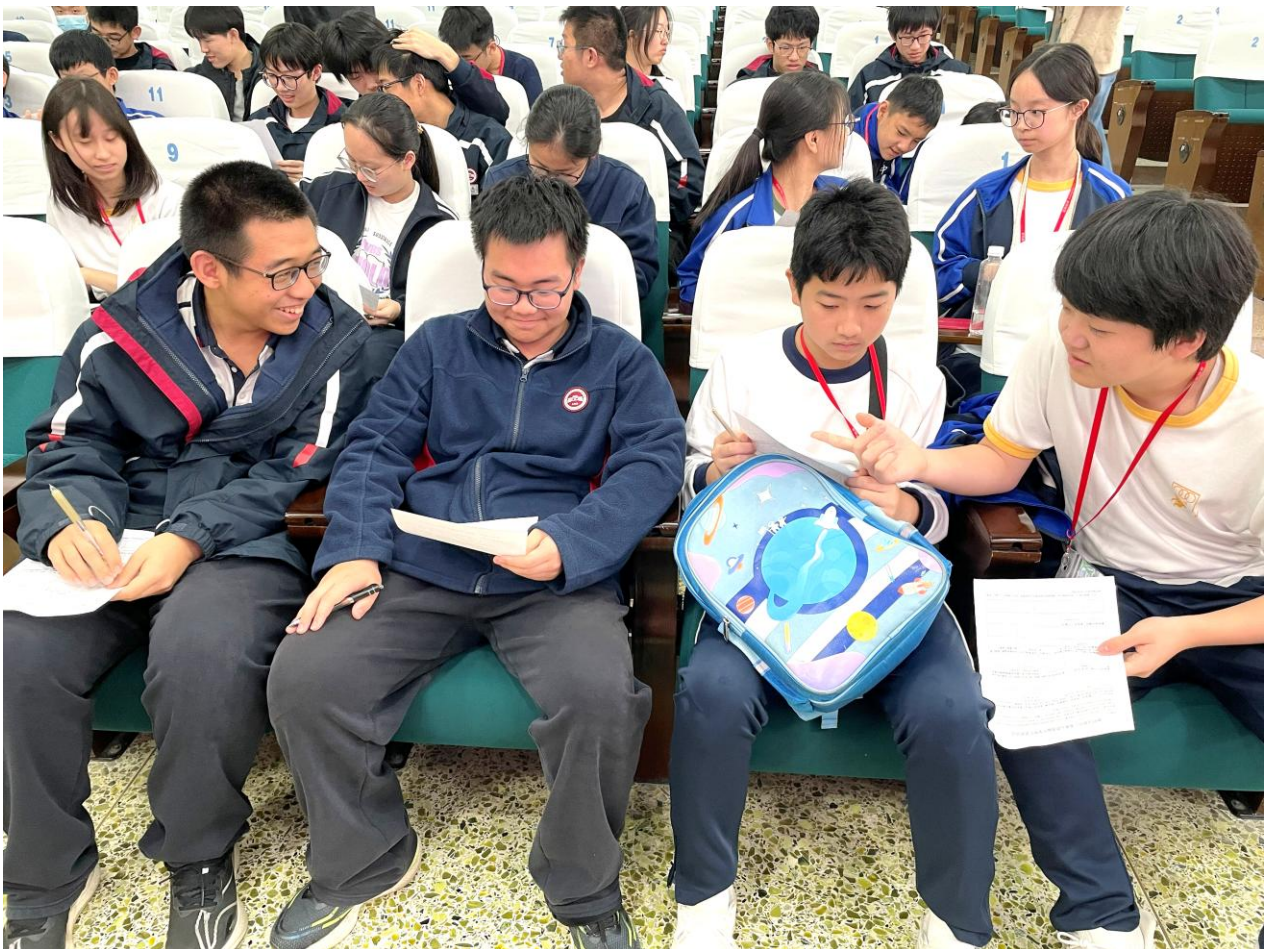
Students from the two schools engage in exchange activity