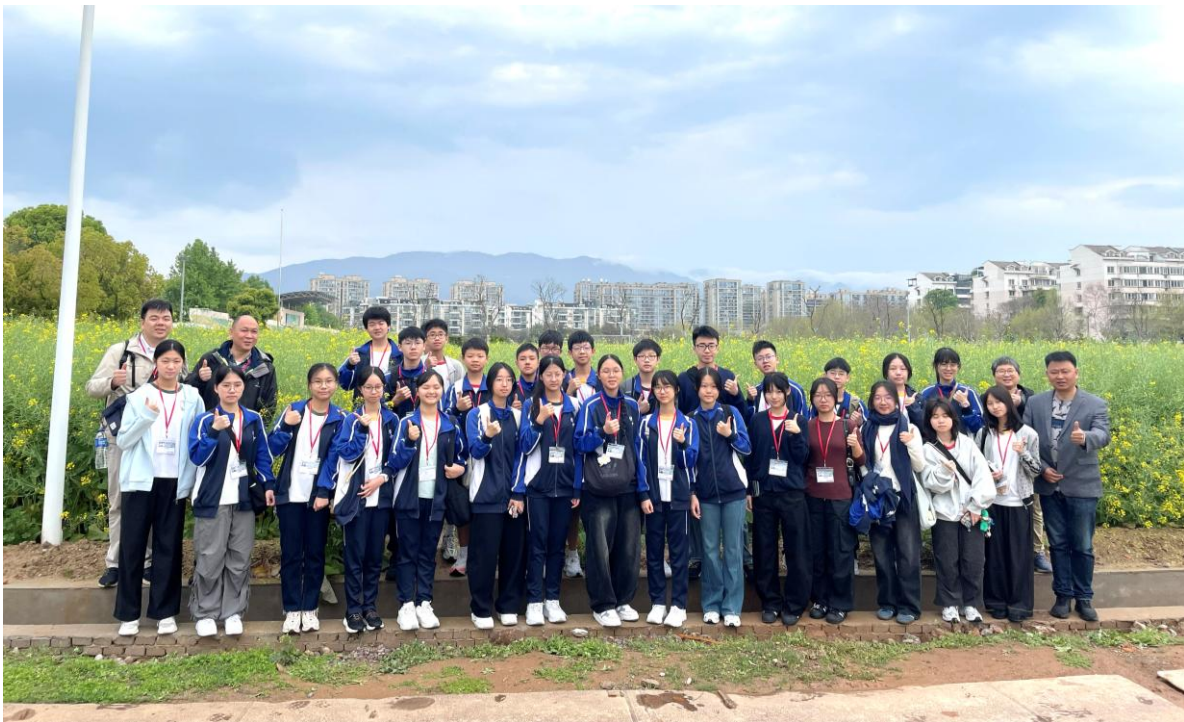
Our teachers and students tour the campus and take a group photo in front of the rapeseed flowers