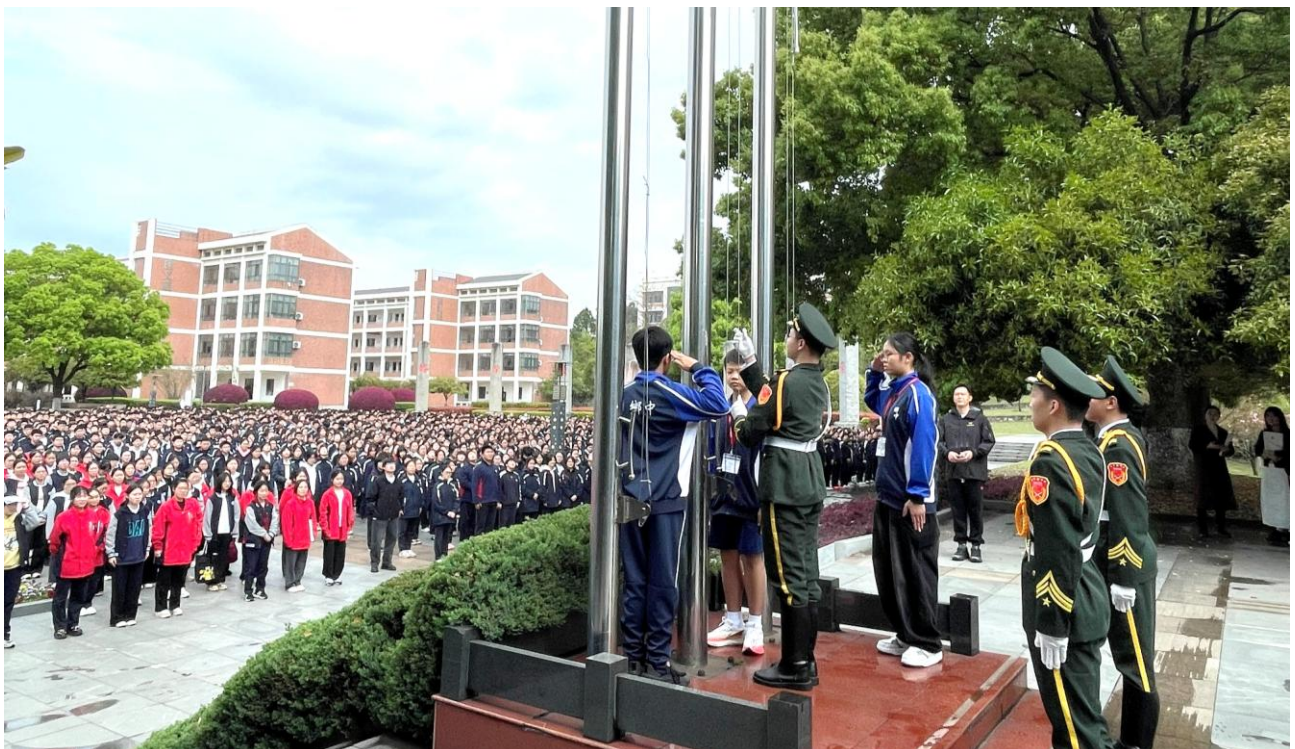
Representatives of our School Flag-guards jointly raise the national flag with students from Jinhua No. 2 High School