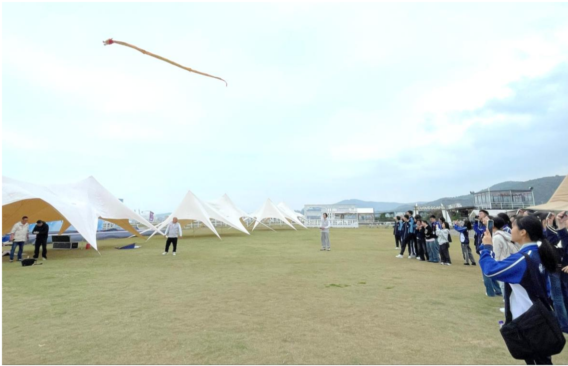
A drone demonstration features the dragon and phoenix, symbolising prosperity and auspiciousness