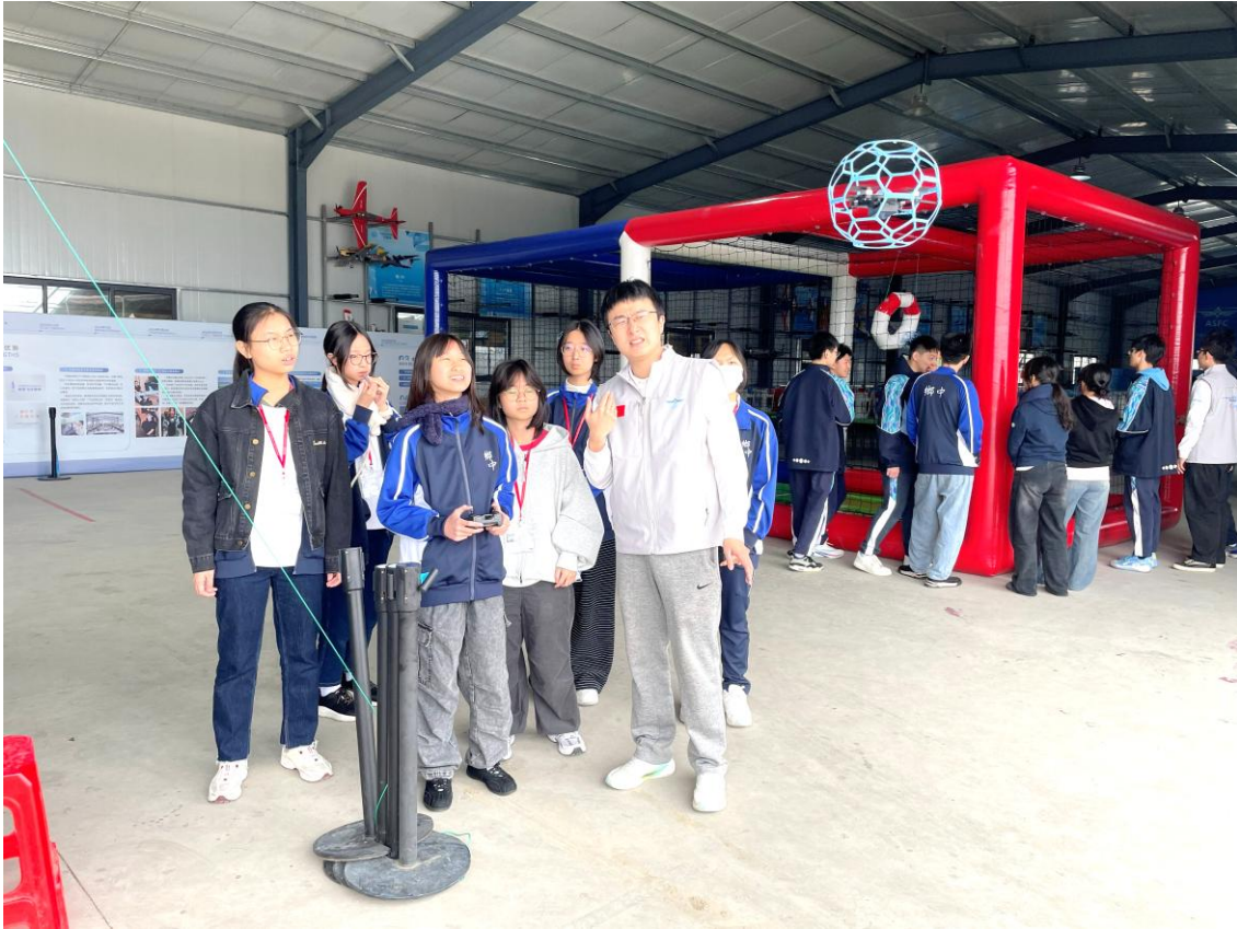
Our students visit the Xianxiang Aviation Flight Camp of Ningbo No. 2 Secondary School to experience drone football