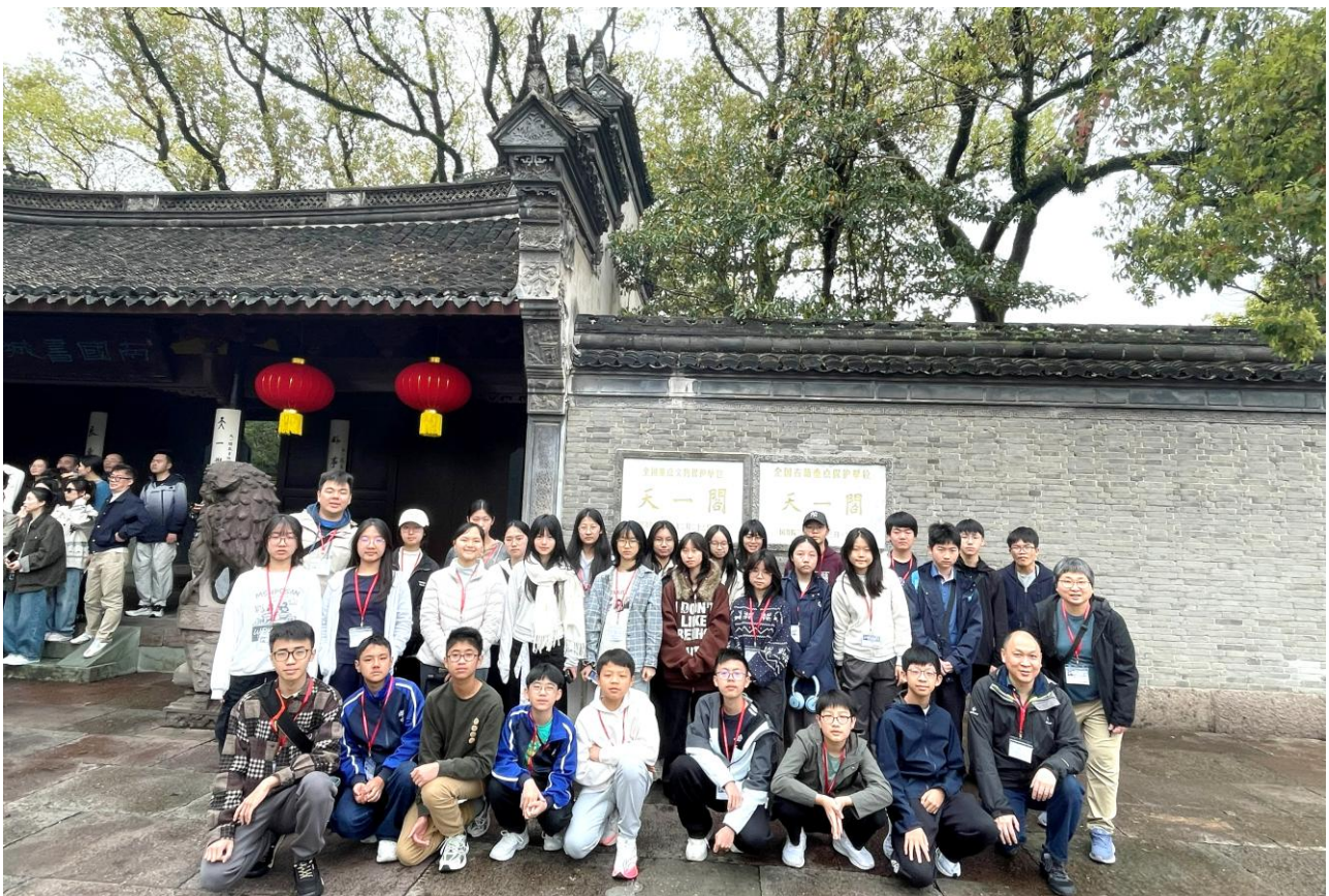
Our teachers and students visit Tianyi Pavilion to learn about the history of ancient Chinese book repositories