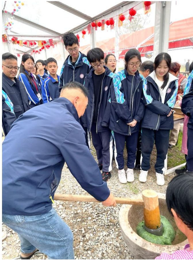
Teachers and students of the two schools make Qingtuan, a traditional food for the Ching Ming Festival