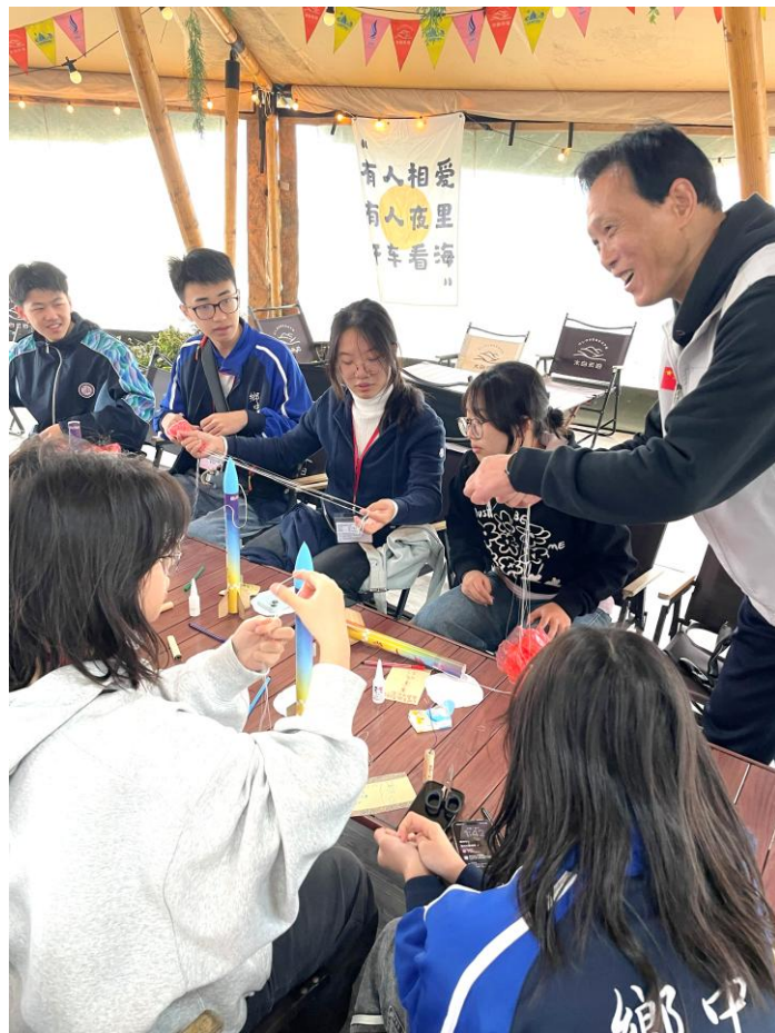
Instructors at the aviation flight camp provide careful guidance to our students in making rockets