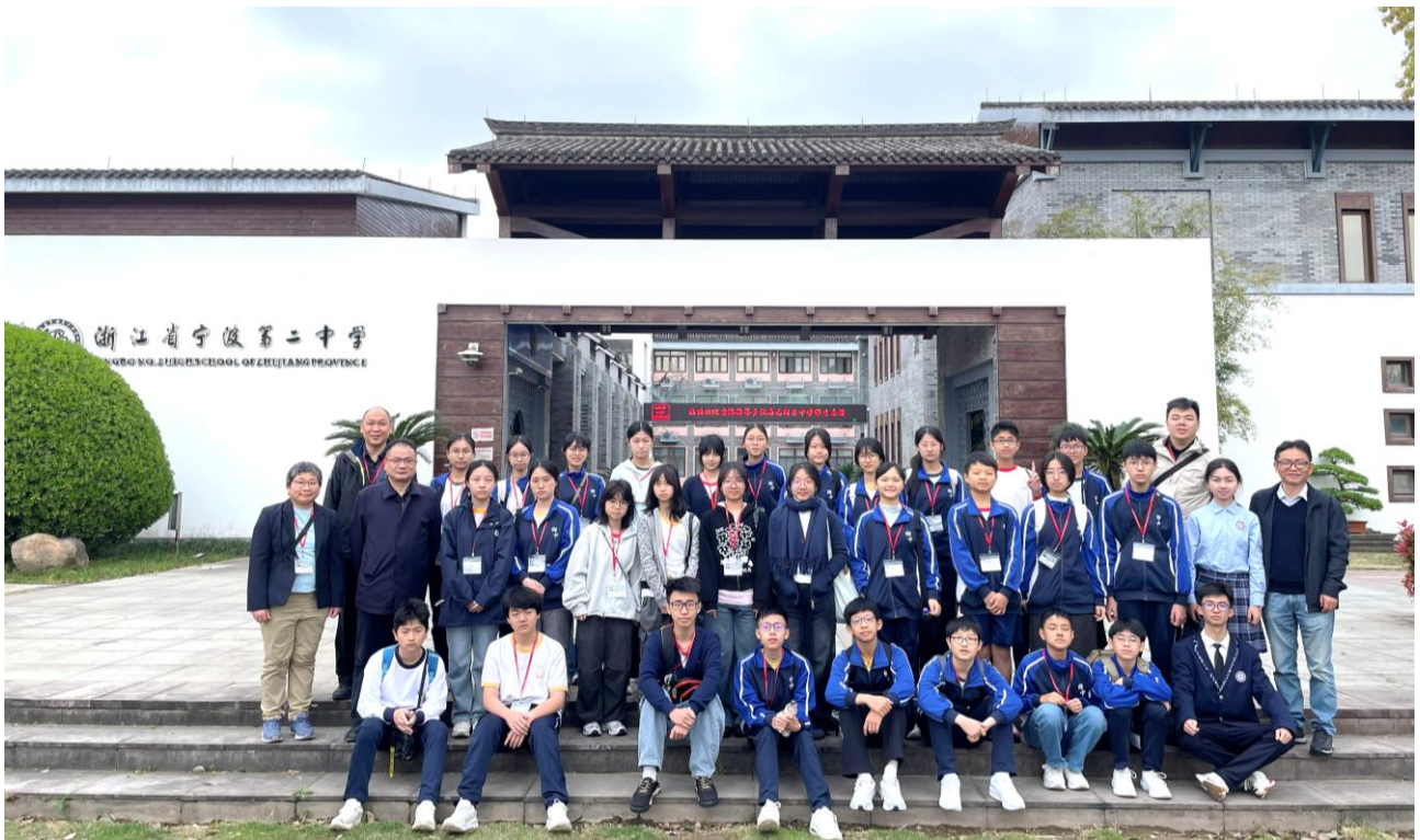
Teachers and students of Ningbo No. 2 Secondary School and our school take a group photo on the school campus