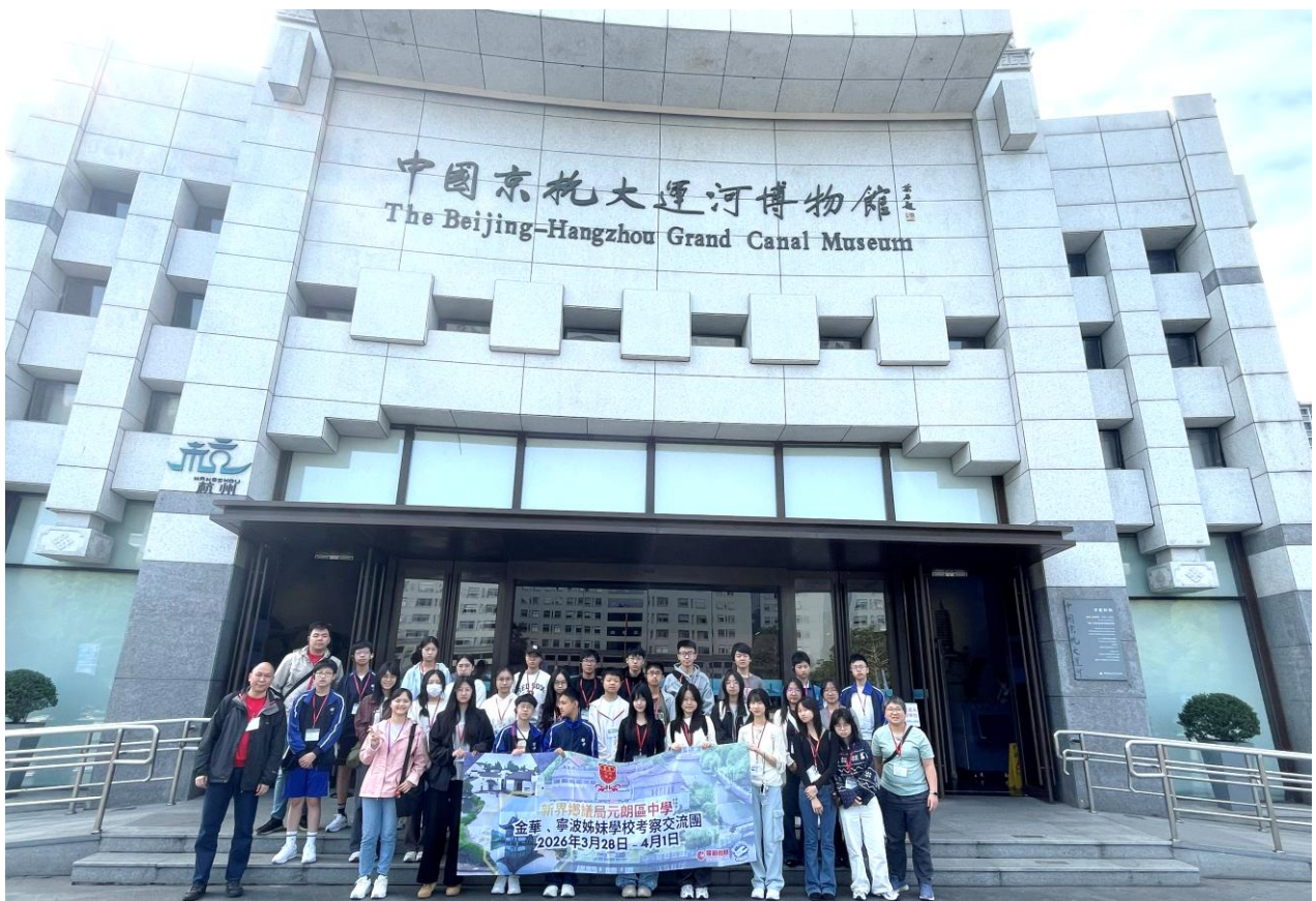
Our teachers and students visit the China Grand Canal Museum to learn about the history of the Grand Canal