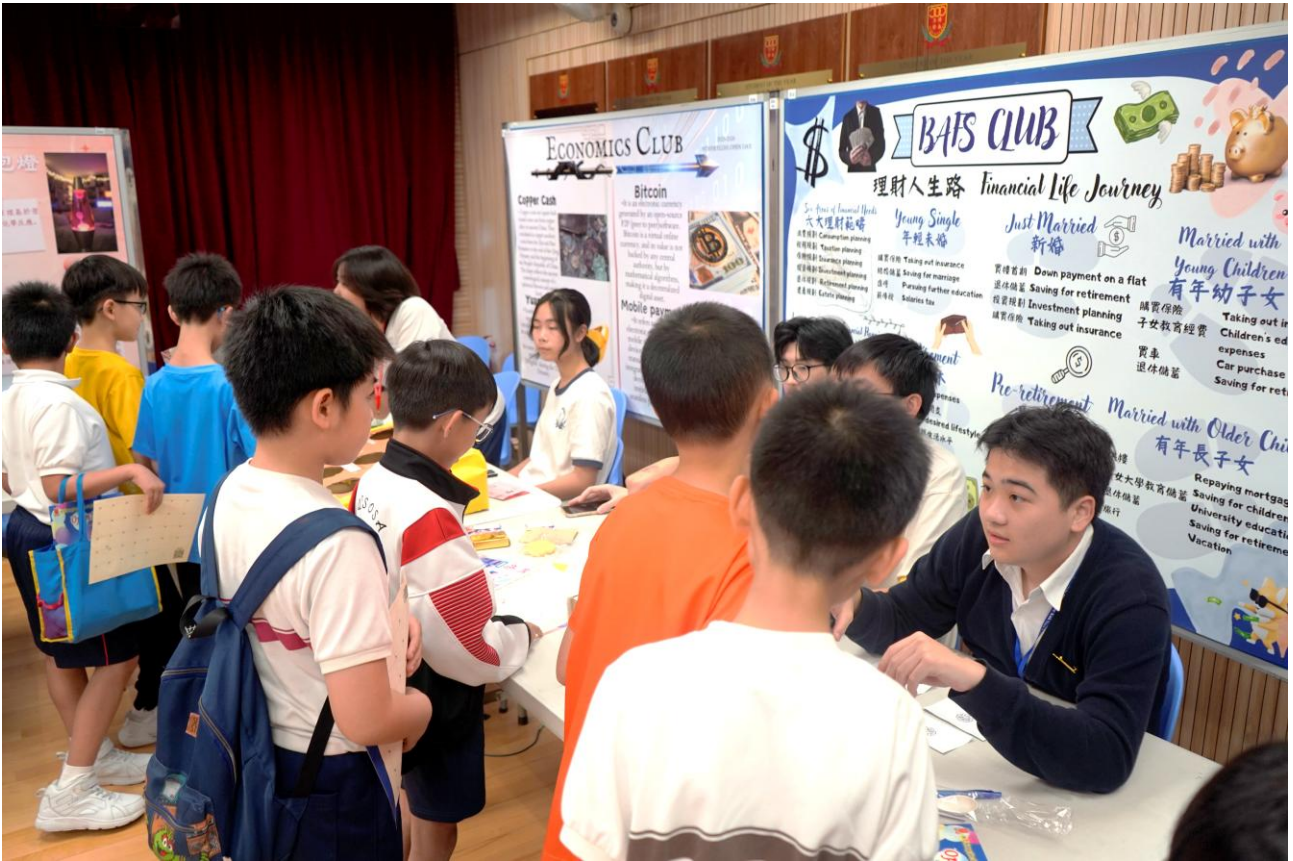
Guests enjoy the booth games at our Open Day