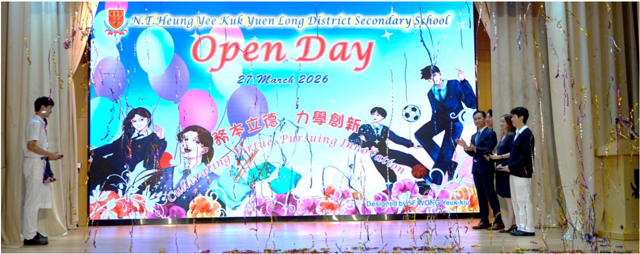
As streamers fill the air, the Open Day officially begins