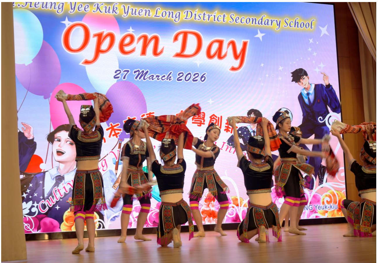
Chinese Dance performance