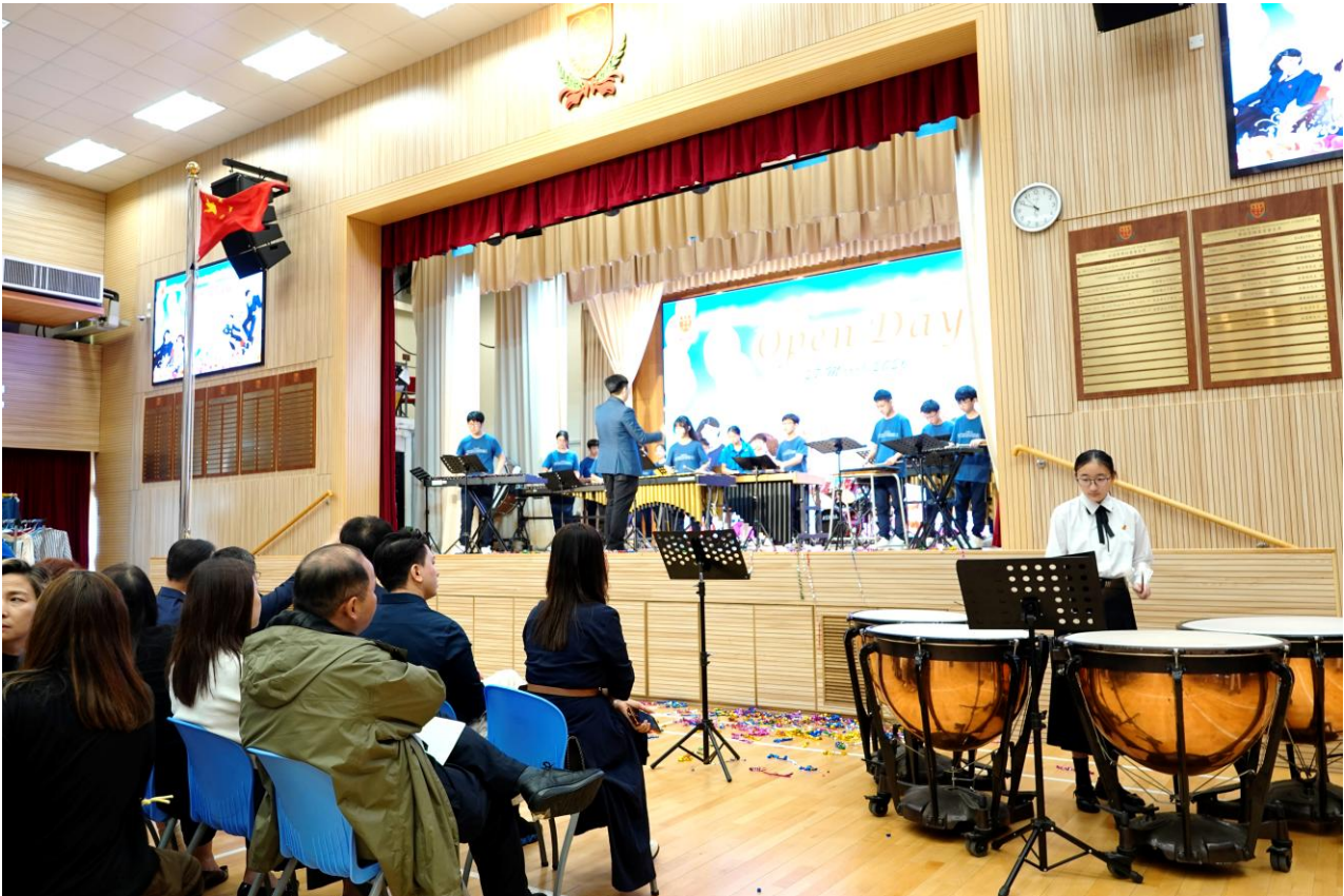
The percussion ensemble kicks off the Open Day with a rousing opening performance