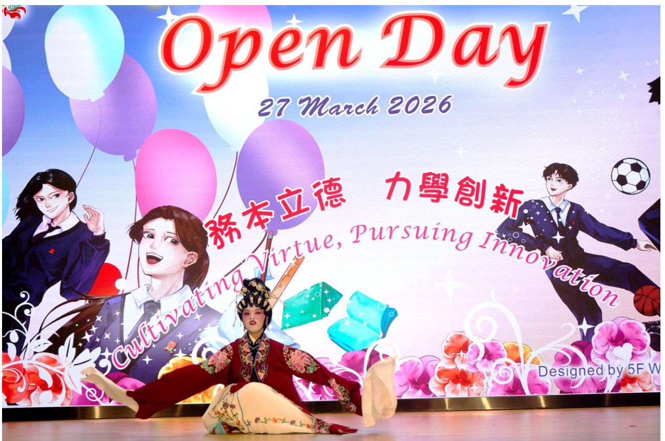
Cantonese Opera performance