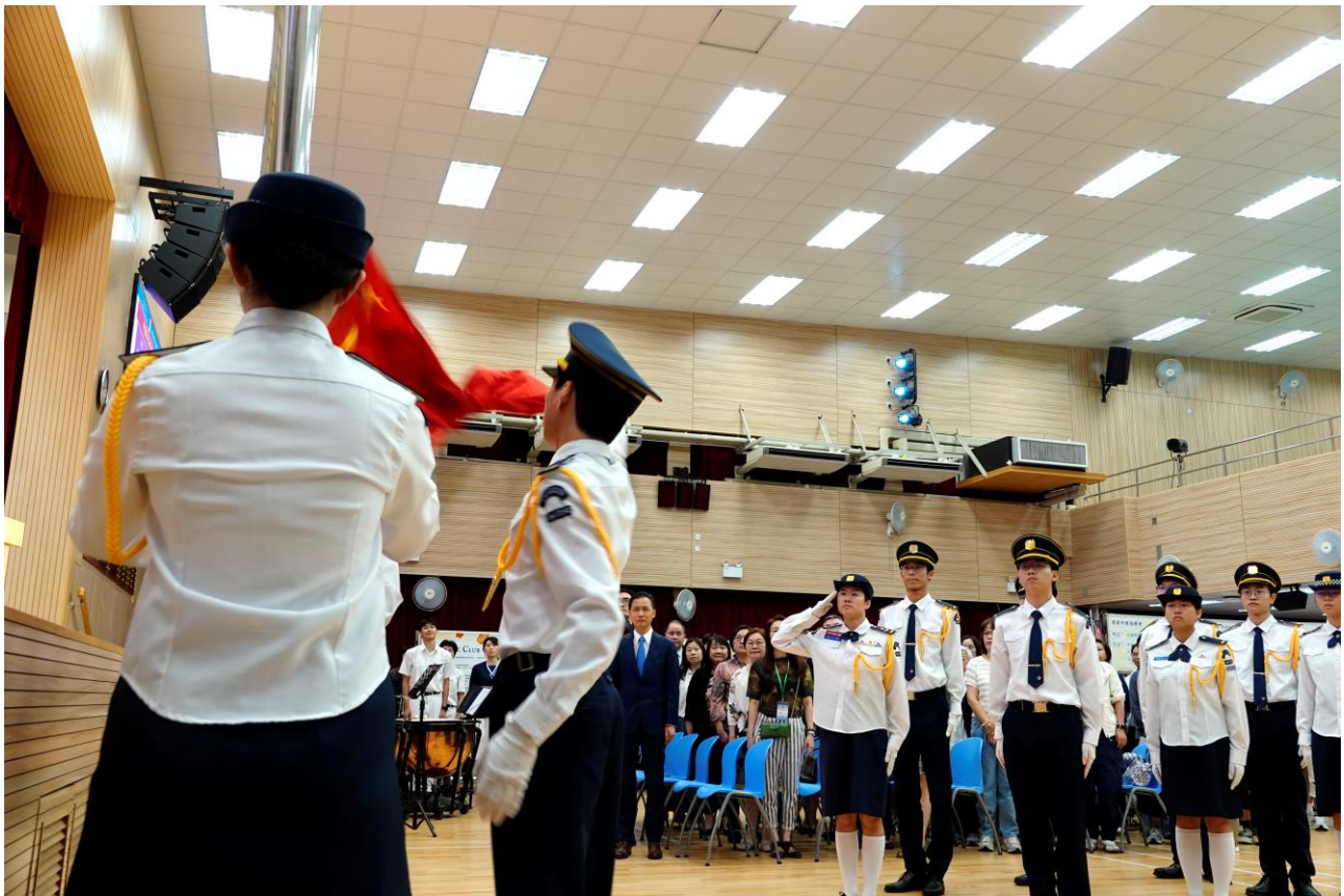
The solemn Flag-raising Ceremony preceding the Kick-off Ceremony