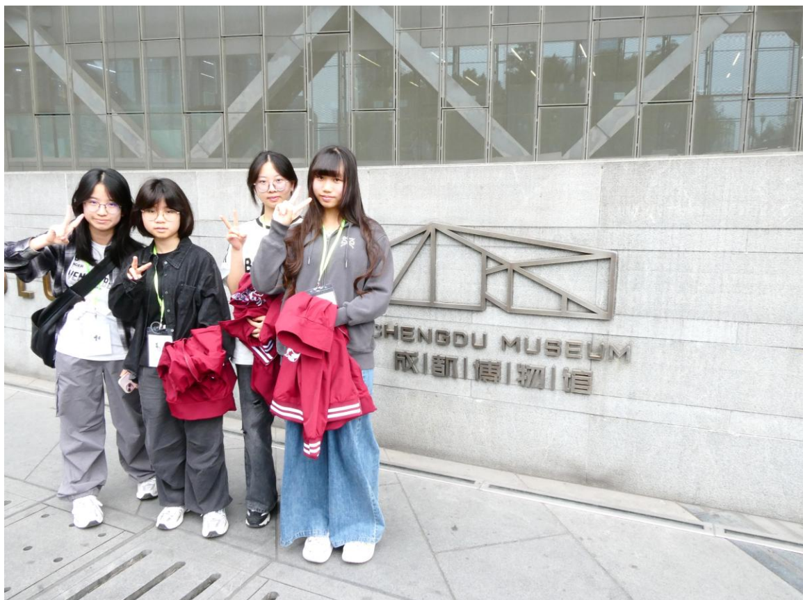
Our students visit the Chengdu Museum