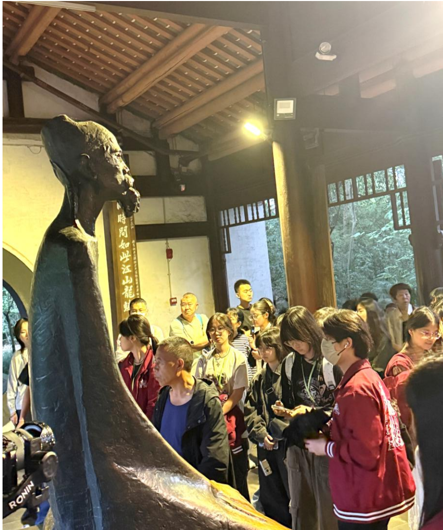
Our students visits and tour inside the Du Fu Thatched Cottage