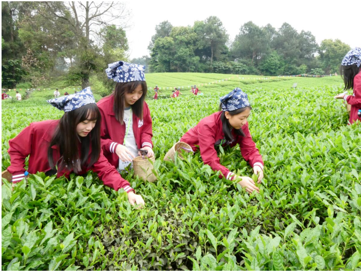
Our students are actively participating in the tea-harvesting activity.