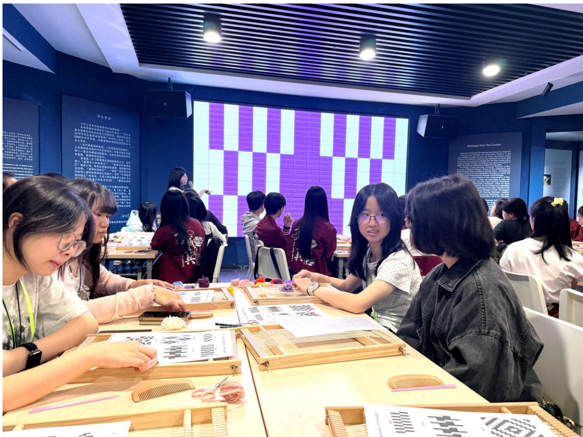
Our students participate in a hands-on workshop to experience the making of Shu brocade, a remarkable intangible cultural heritage