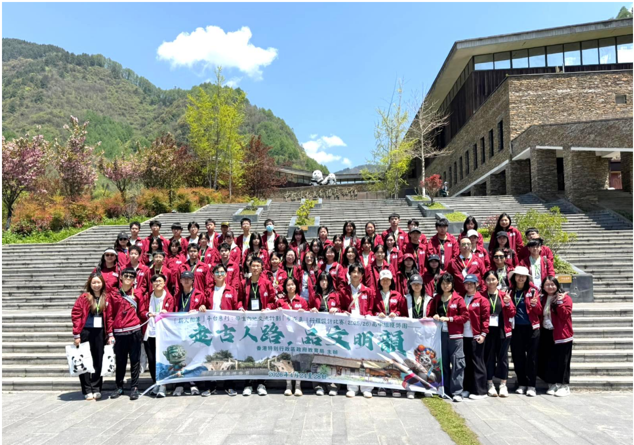
Our students pose for a photo at the Wolong Shenshuping Panda Base