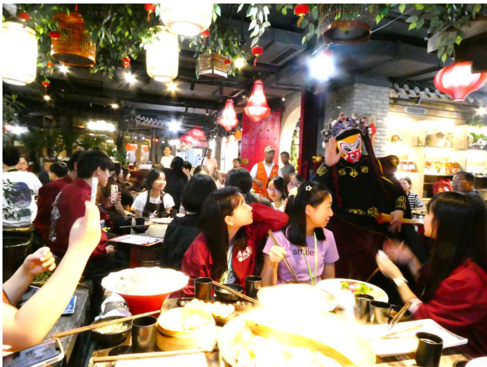
Our students enjoying the incredible Sichuan Opera 'Face-Changing' performance during dinner