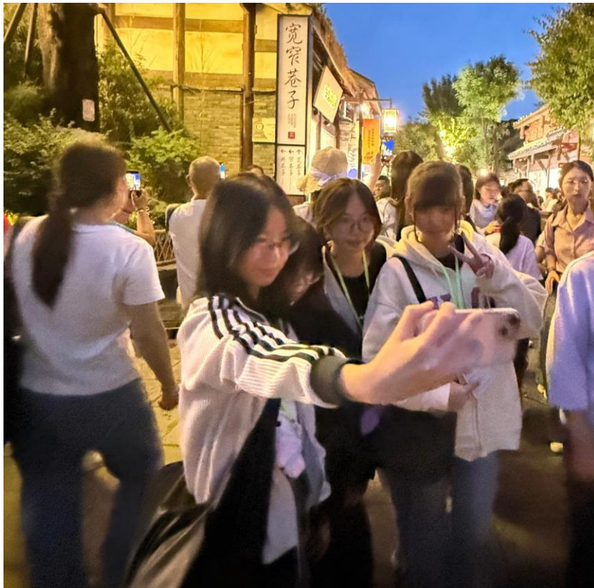
Our students visit Kuanzhai Alley at night