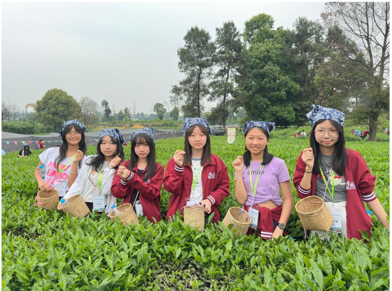
Our students experience the work of tea harvesting at the Shixianghu International Study Camp