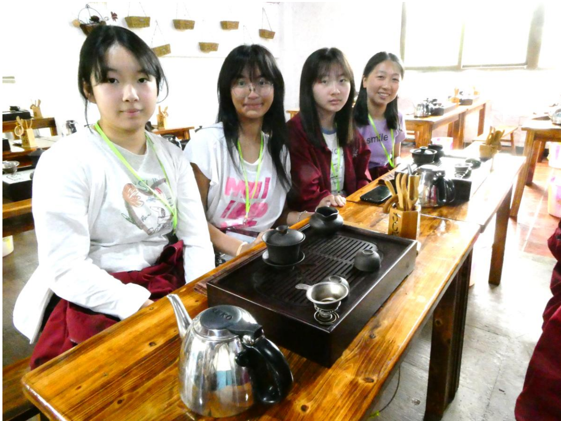
Through the art of tea brewing, our students gained a deeper appreciation for traditional Chinese culture