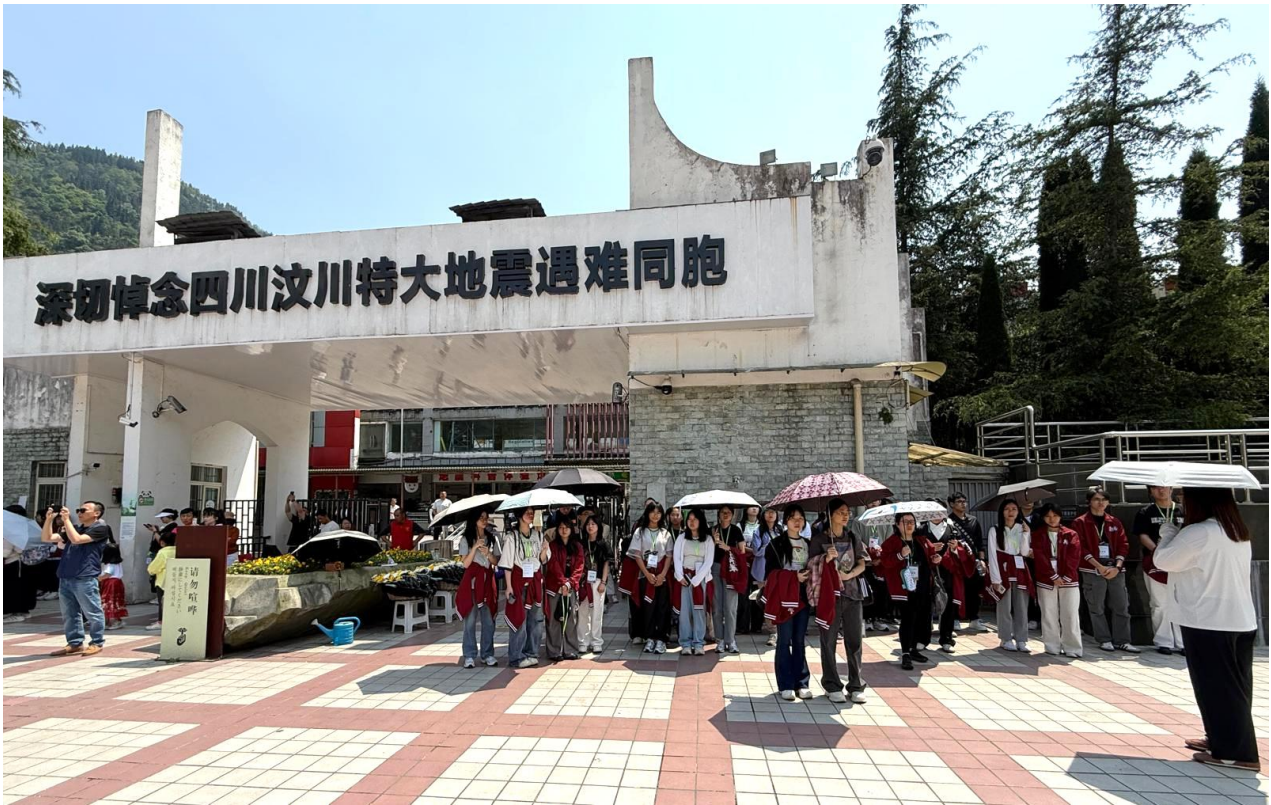
Our students visit the 5·12 Wenchuan Great Earthquake Memorial Museum