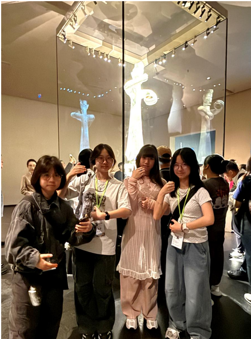
Our students visit and tour inside the Sanxingdui Museum