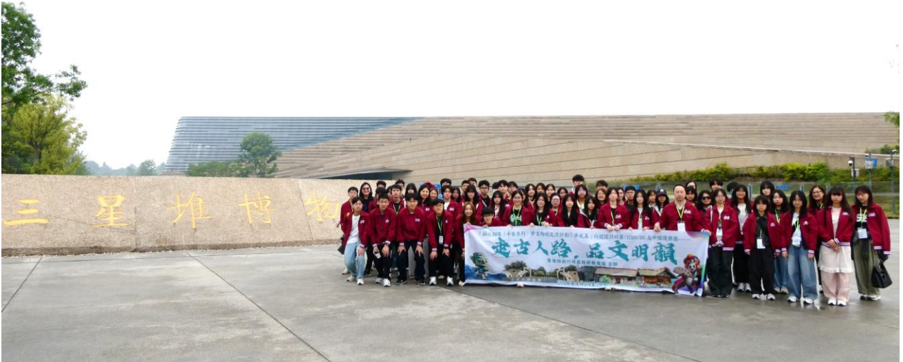
Our students and all participants pose for a group photo in front of the Sanxingdui Museum