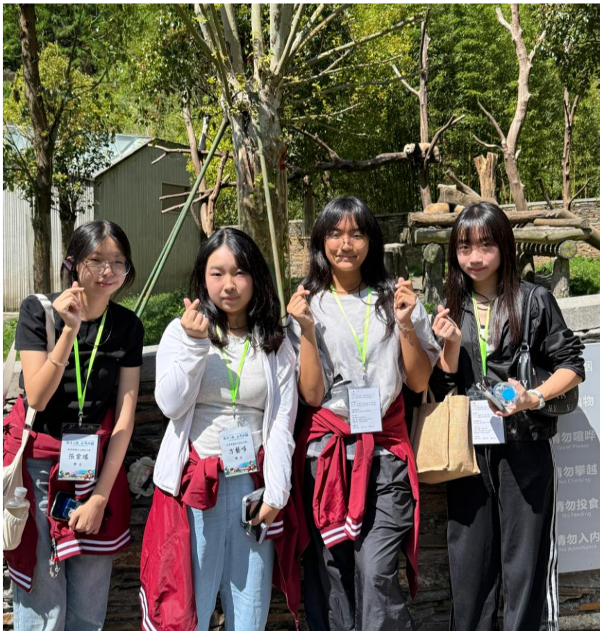
Our students visit the Wolong Shenshuping Panda Base